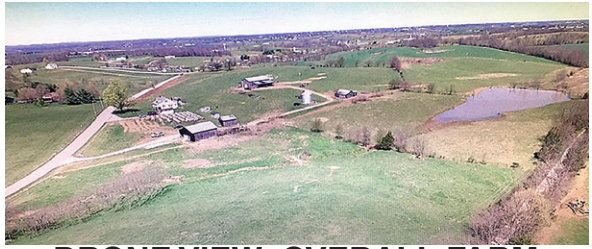
DRONE VIEW: OVERALL FARM