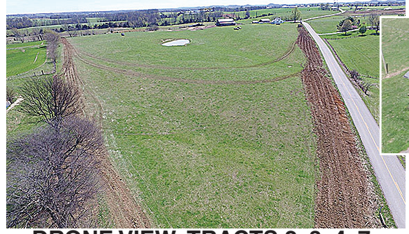
DRONE VIEW: TRACTS 2, 3, 4, 7