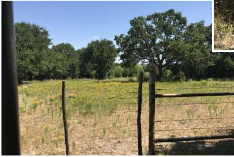
Abundance of Wildlife