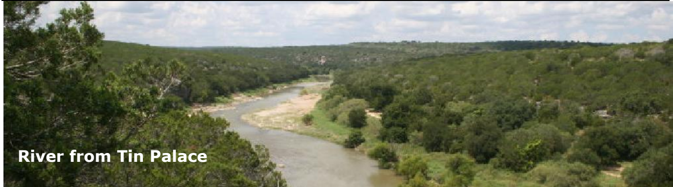
River from Tin Palace