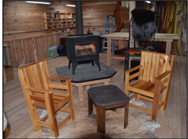
Cedar—floor & walls