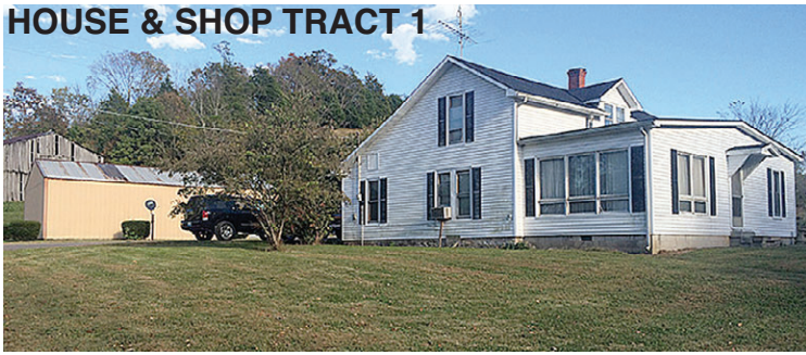
HOUSE & SHOP TRACT 1

1. EXHIBIT ONLY. NOT FOR RECORDING OR LAND TRANSFER. 2. JOINT ACCESS EASEMENT BETWEEN FOR TRACTS 2 AND 3.