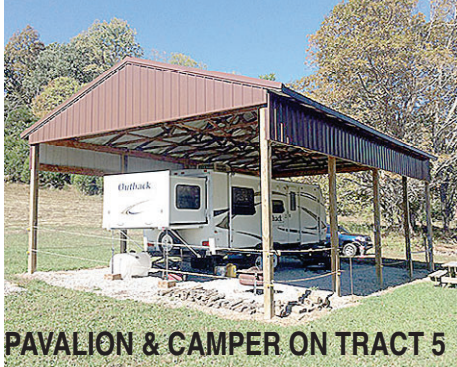
PAVALION & CAMPER ON TRACT 5