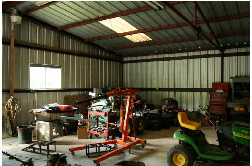
Lawnmower Repair Area