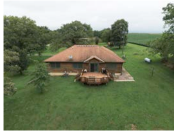
Back of Home