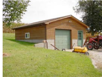
Detached 22' X 24' Shop