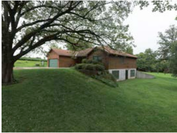
Front of Home