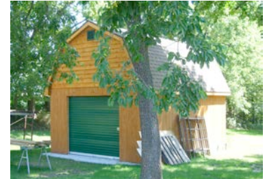
Newly Built Additional Shop with Loft!

Here is a GORGEOUS eleven-year-old cedar-sided self-built Miles' home that you need to see to believe! Nestled on a secluded seven acres (+/-), you feel like you are living in your very own park or wildlife refuge! Located just one mile off of Hwy W, and only 5 miles from I29, this property is very easy to get to and is centrally located between Omaha and Kansas City! Includes SIX BEDROOMS, THREE BATHS, and a full finished basement so you have PLENTY of room for either a growing family or any family gathering!