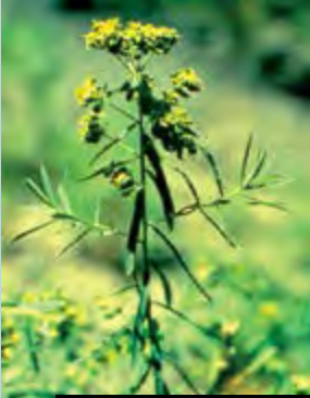
Leafy Spurge ( Euphorbia esula )