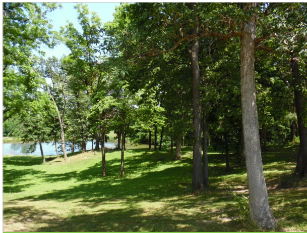
Peaceful Rural Setting