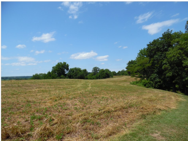
Well-Maintained Grassland & Timber

2240 West Morton Avenue, Jacksonville, IL 62650 WORRELL LAND SERVICES, LLC