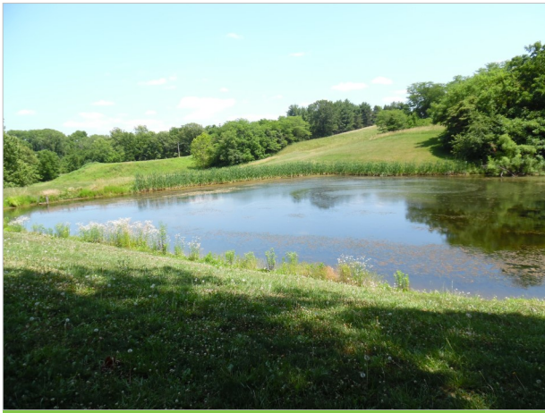
Stocked Pond Visible From Back Porch