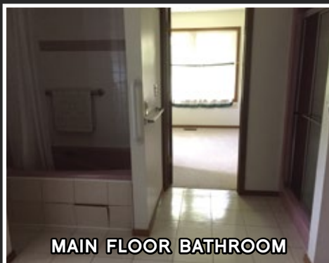
MAIN FLOOR BATHROOM