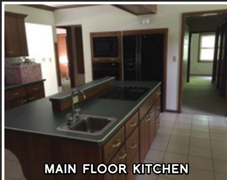
MAIN FLOOR KITCHEN