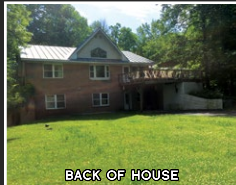
BACK OF HOUSE