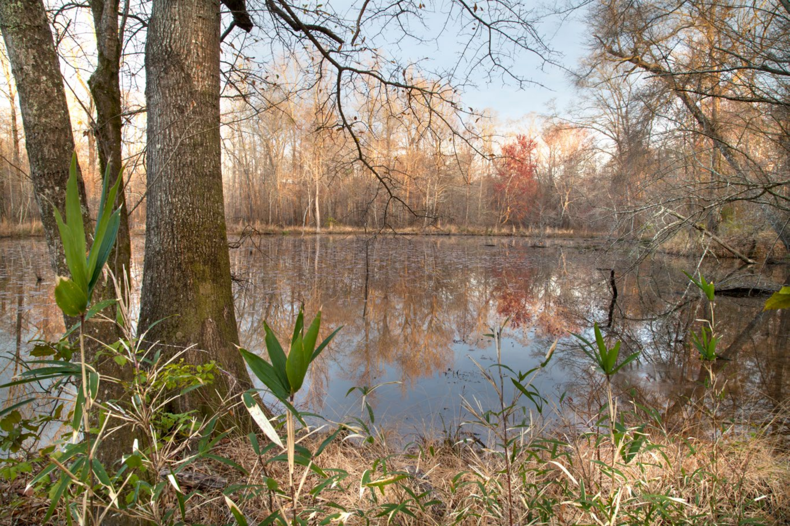
Forests are rich with natural hardwoods stands, from the oak and beech uplands to the cypress and tupelo bottoms.