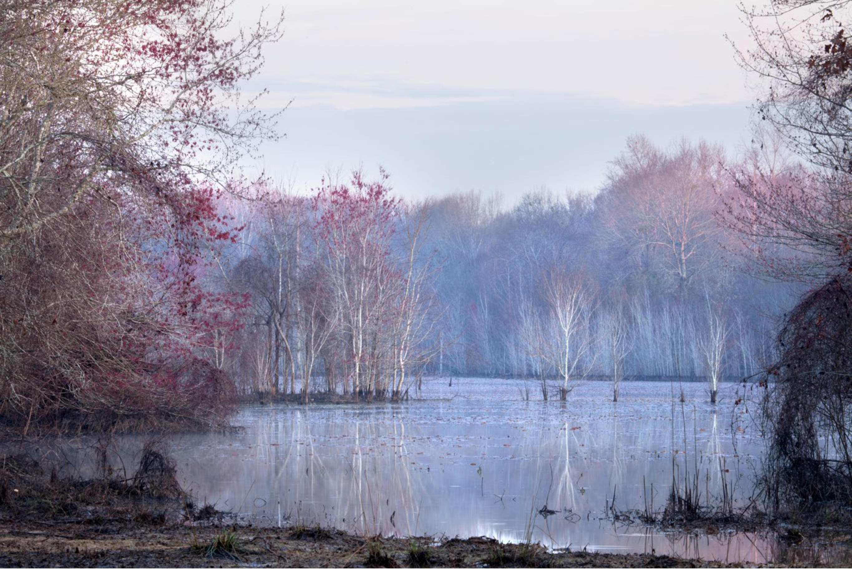
Five sloughs cover 68 acres. Three are spring fed. Good roads to all sloughs.