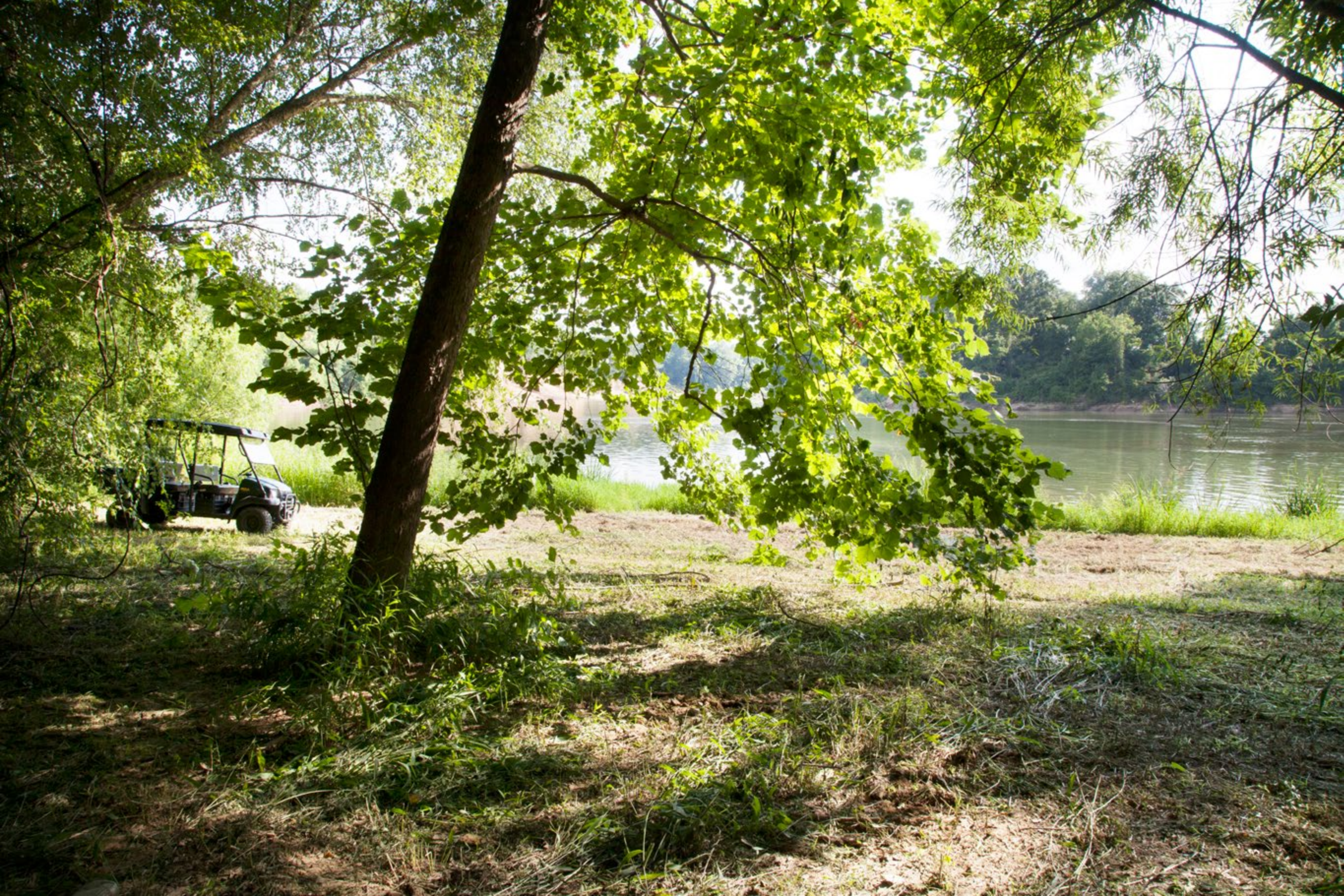
Broad meadows along the river make a great spot for picnics or family gatherings.