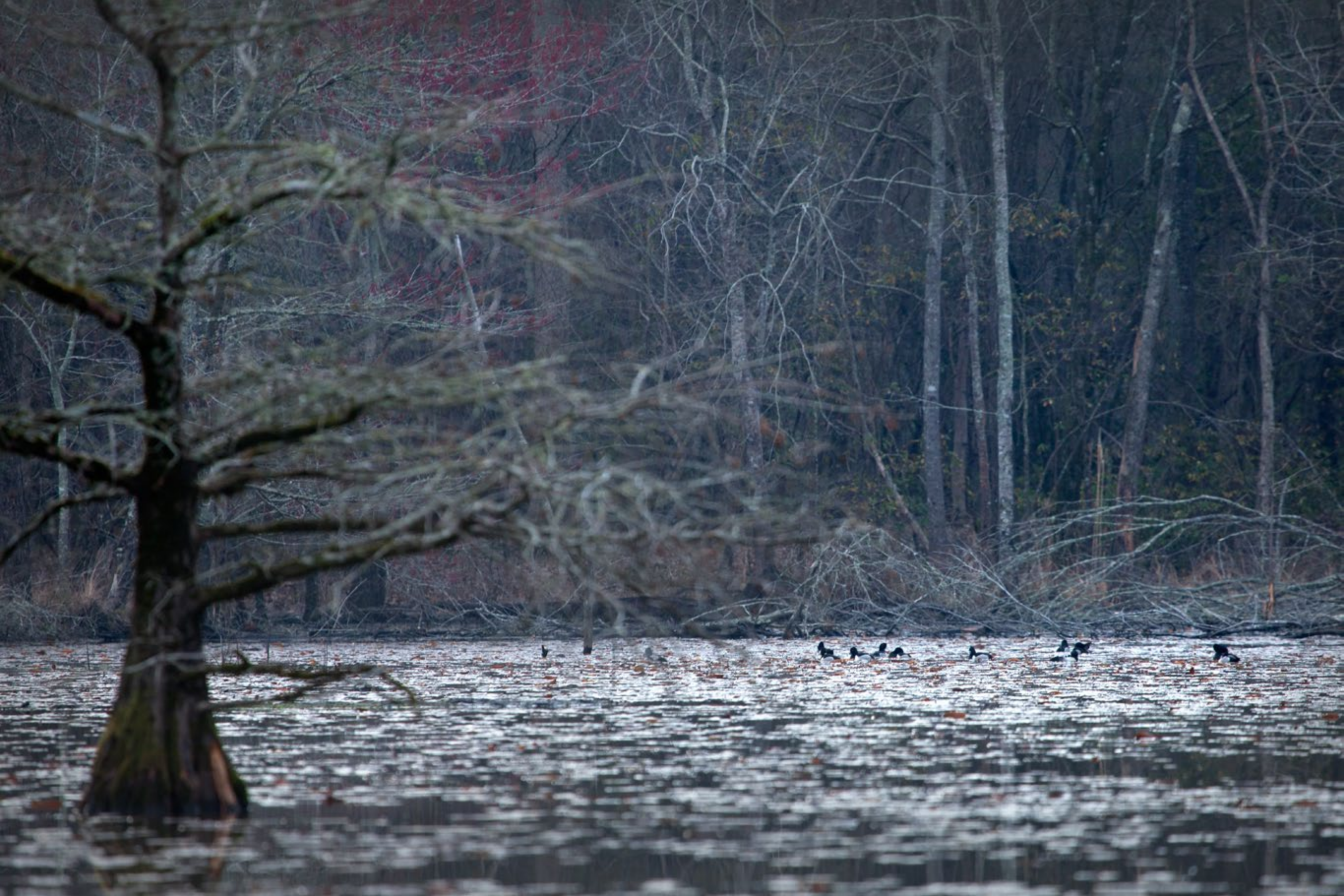
Along a major flyway for fall and winter ducks.