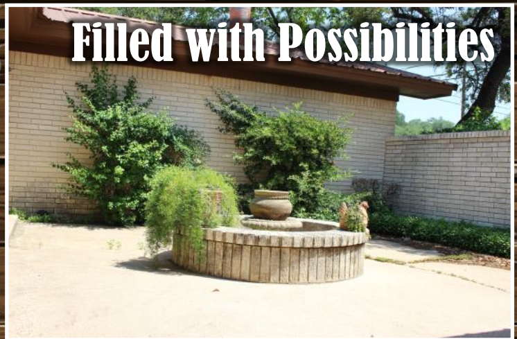
Filled with Possibilities