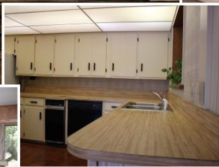
Kitchen with Ample Cabinet Space