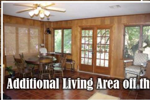
Additional Living Area off the Kitchen