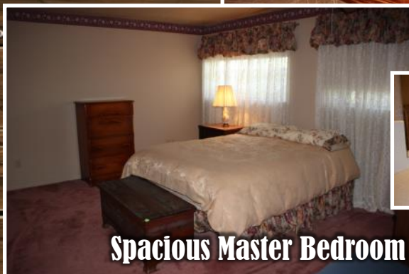
Spacious Master Bedroom