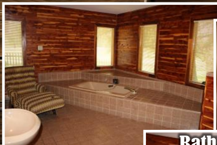
Bathroom with Jacuzzi & Walk-In Shower