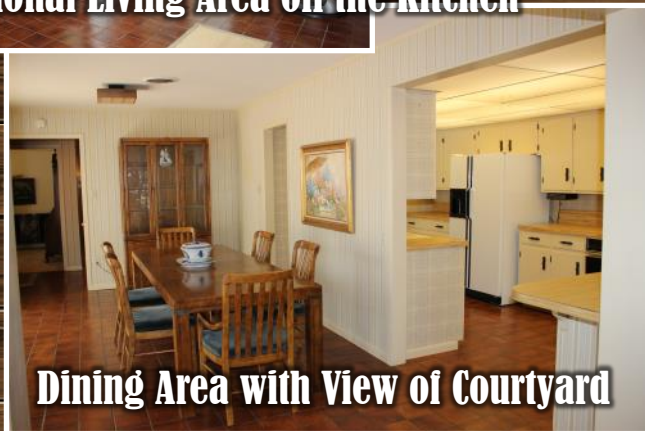
Dining Area with View of Courtyard