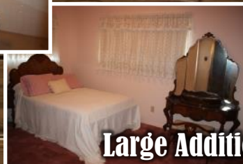
Large Additional Bedrooms