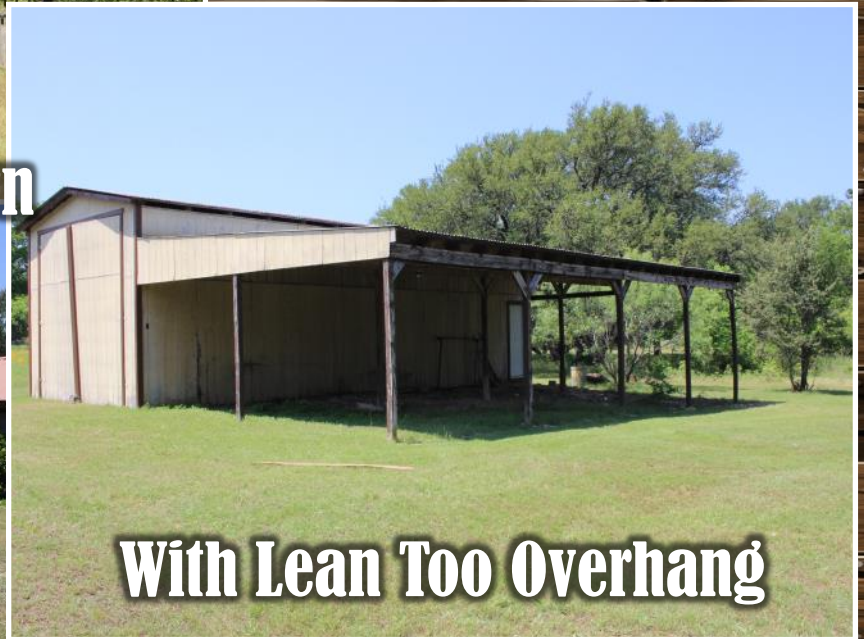
With Lean To Overhang