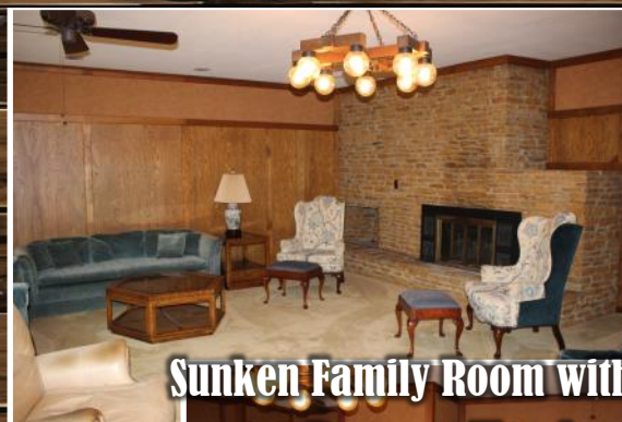
Sunken Family Room with Propane Fireplace