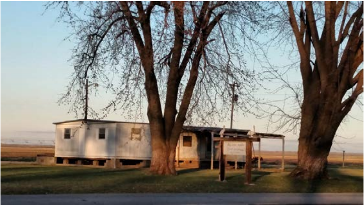
Unused mobile home