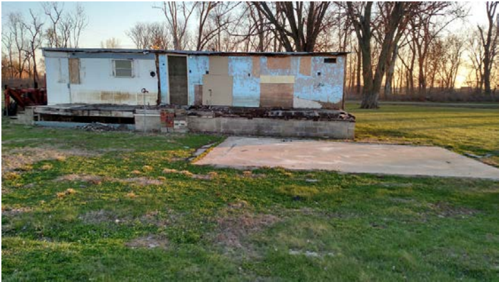
Concrete slab behind unused mobile home