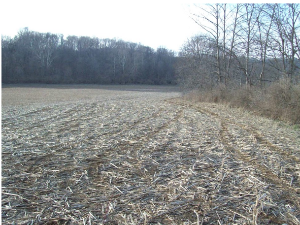
Ready To Hunt!