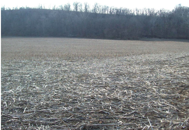
Easy Access Via Blacktop Road