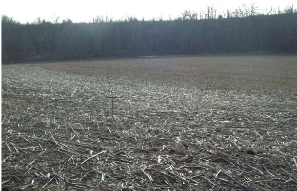
Income Potential Meets Recreation