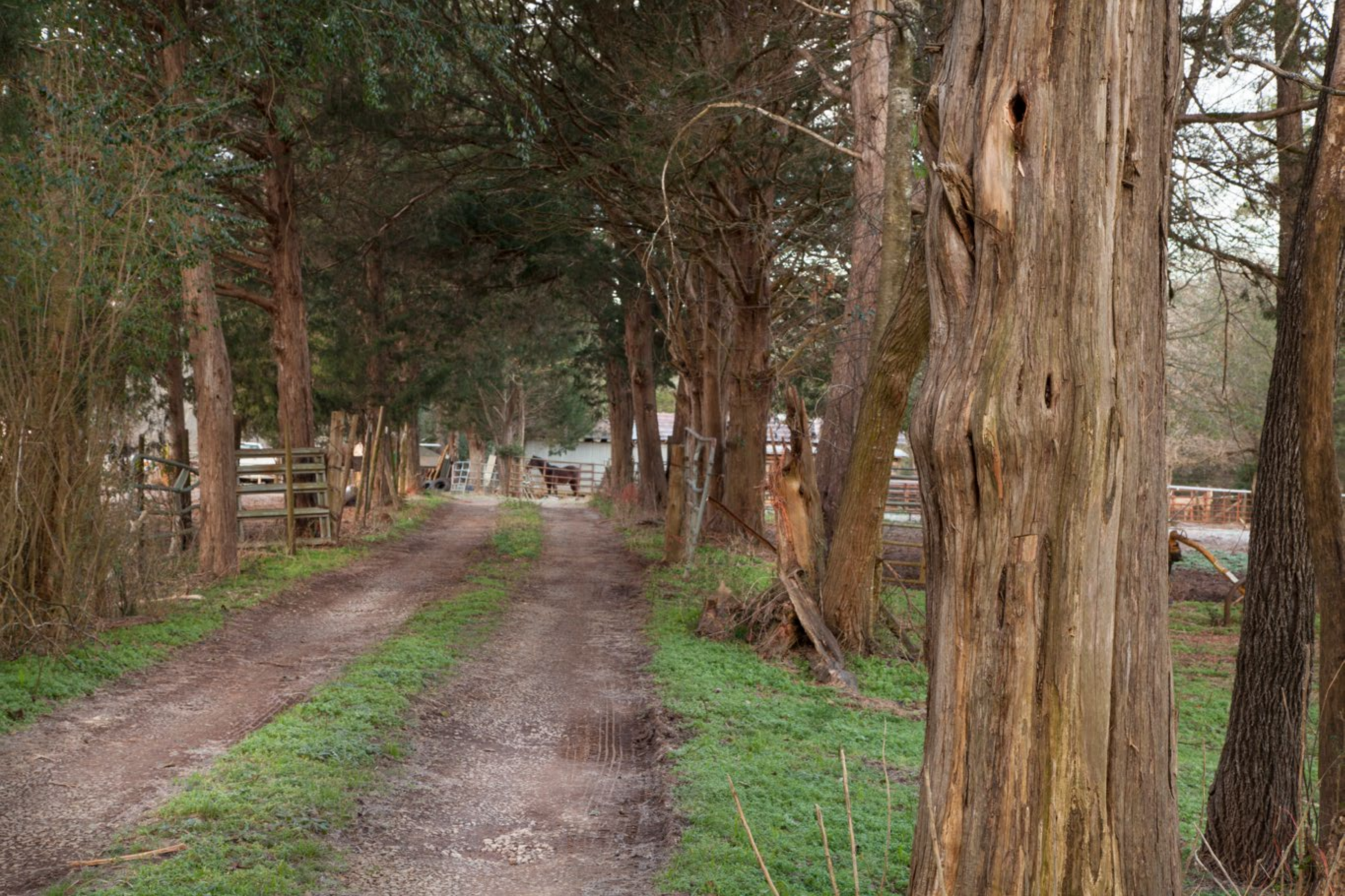
Cedar lined drive from Highway 119 looking Norhtwest.