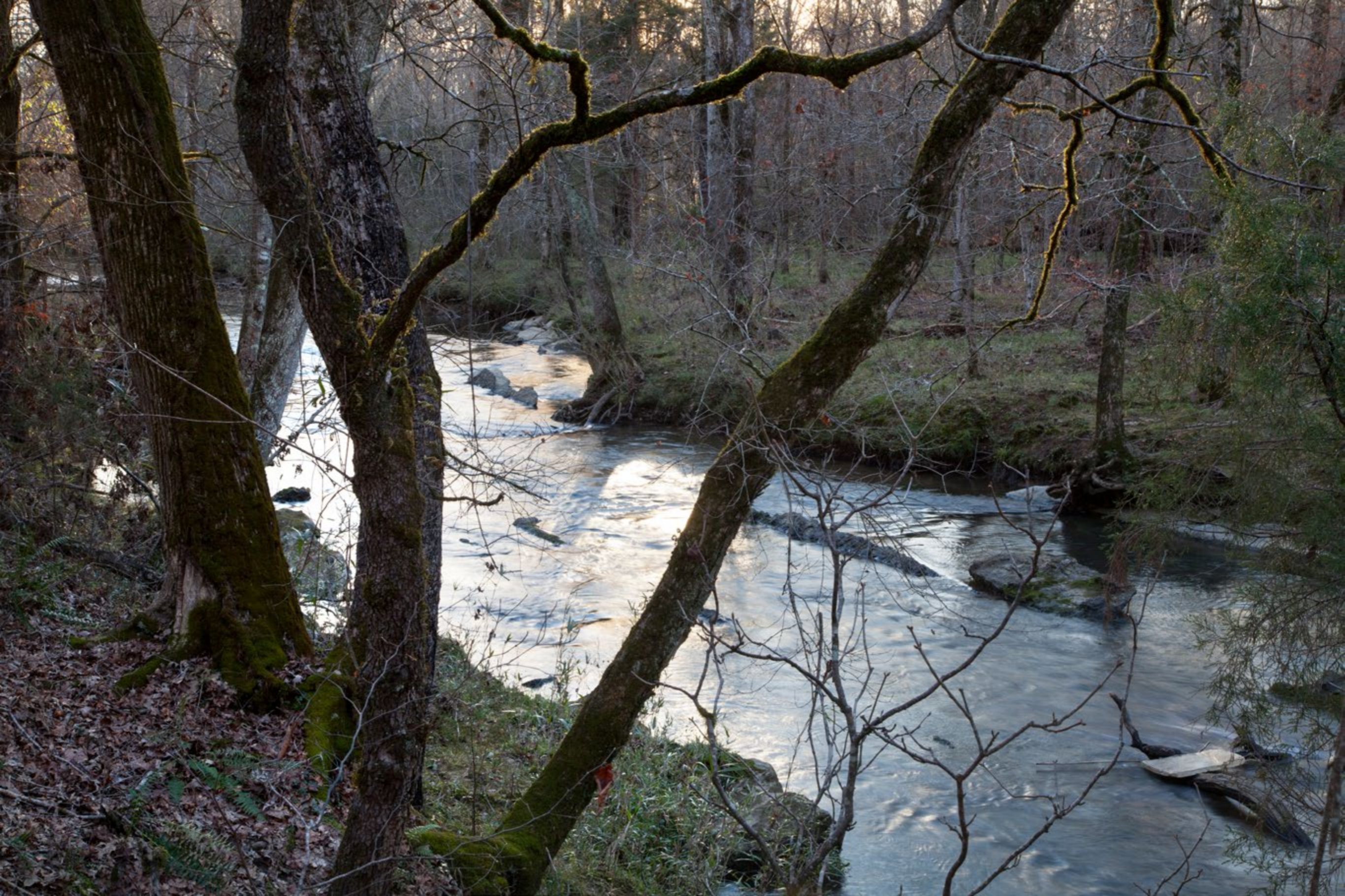
Little Cahaba River flowing toward Lake Purdy.