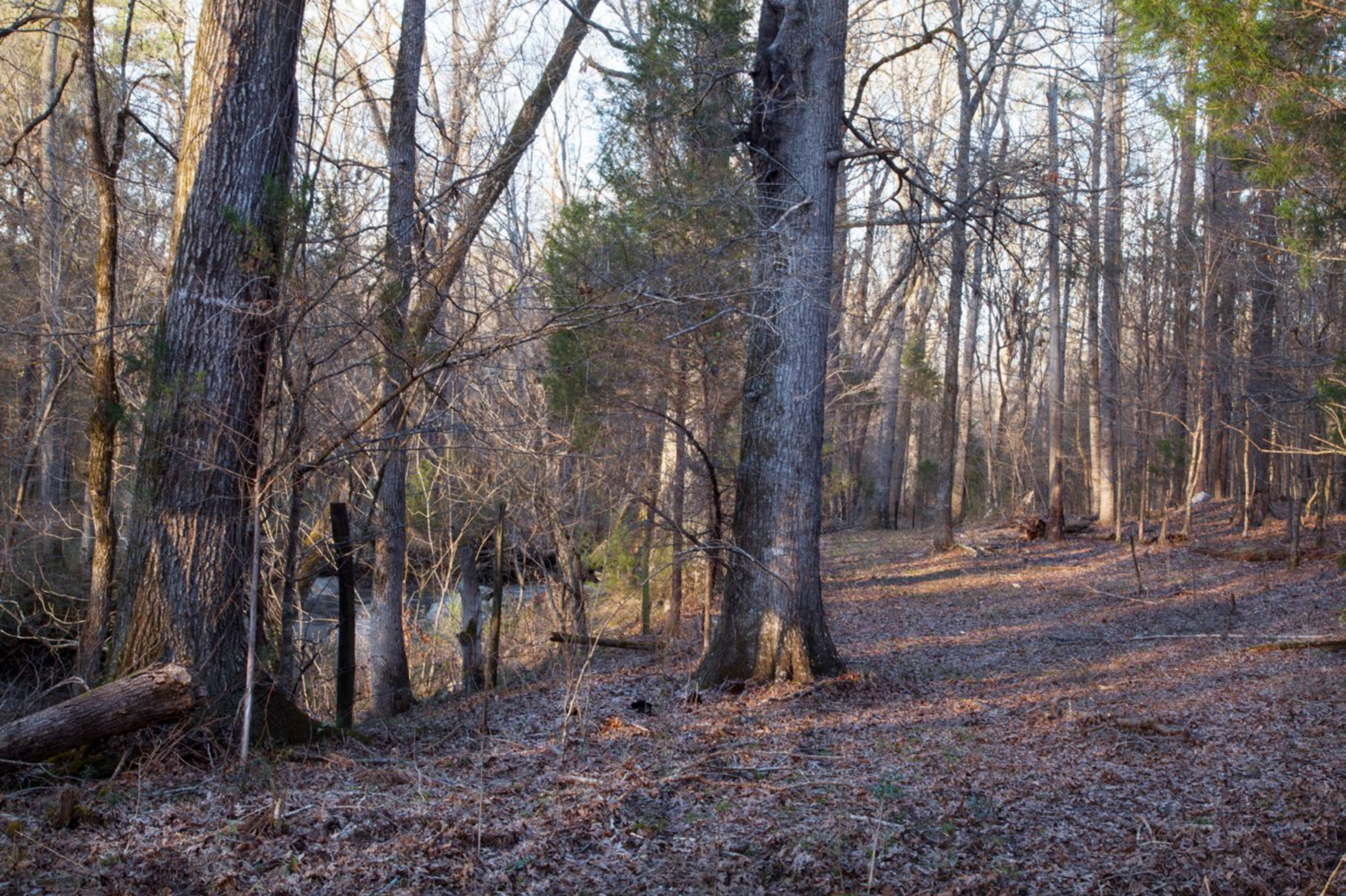
Trail through mature oaks and hickories along the Little Cahaba, heading upstream toward Leeds.