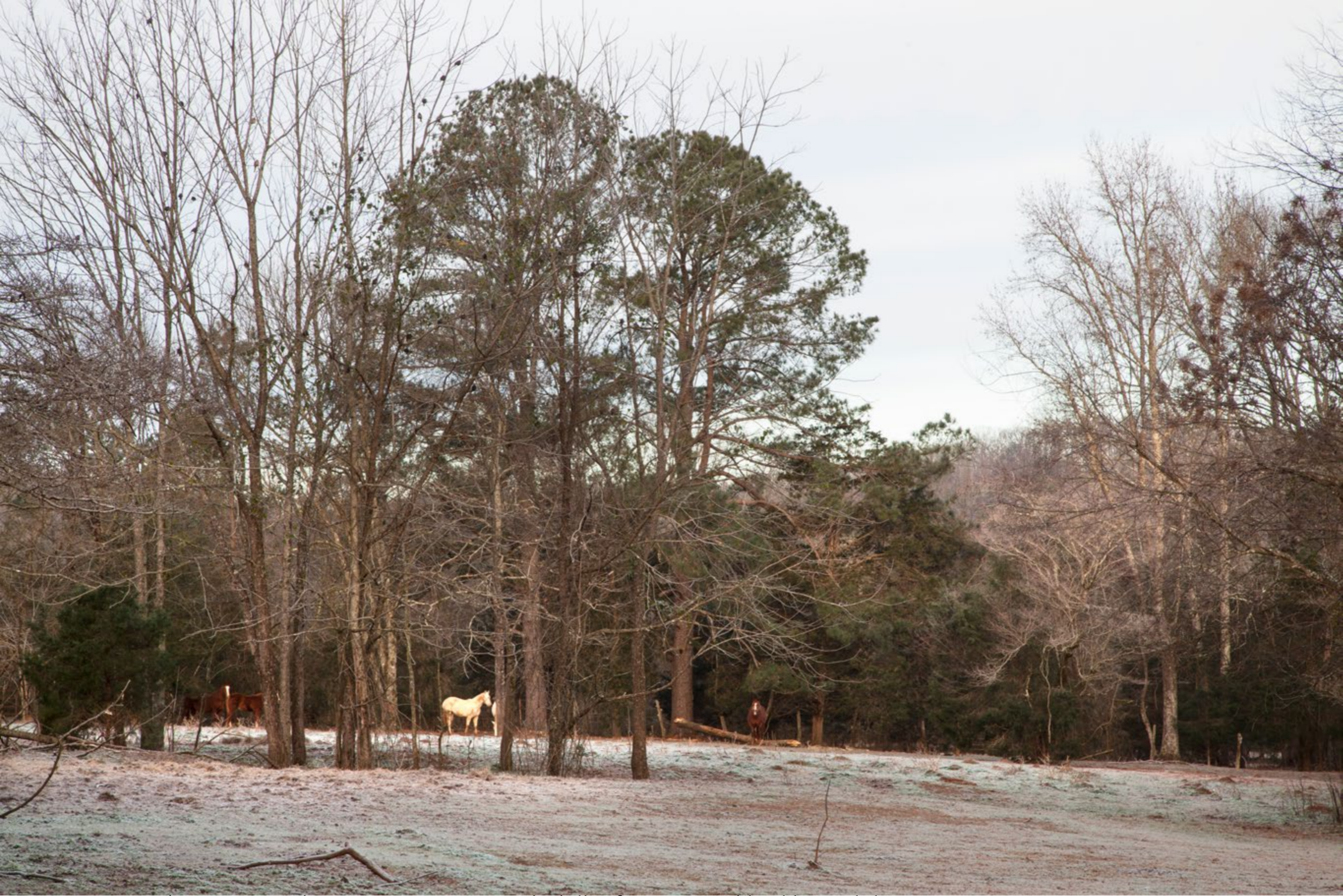
Frost paints the pastures and winter opens a view to the hills of Water Board land beyond the river.