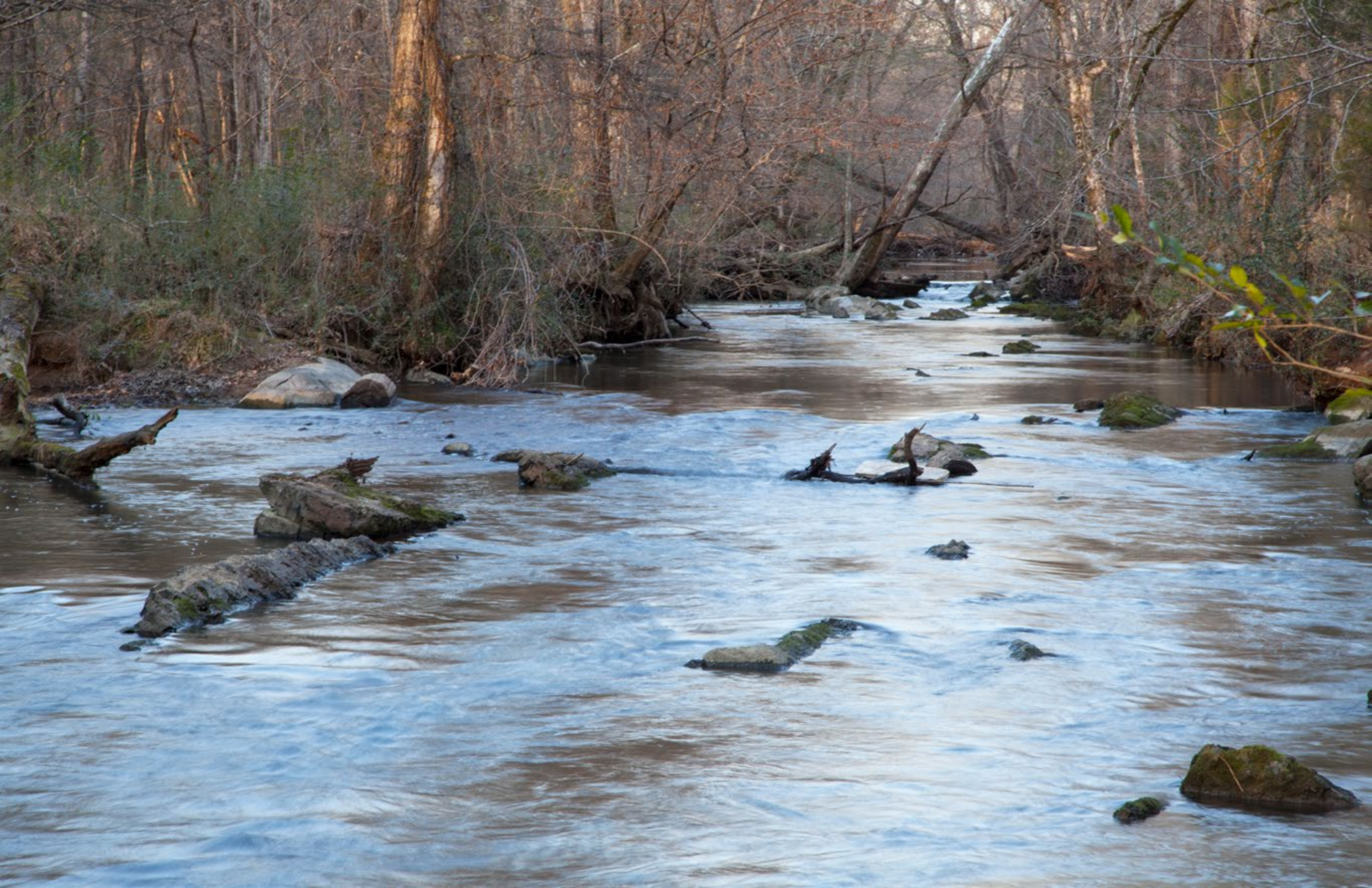
Little Cahaba River looking upstream.