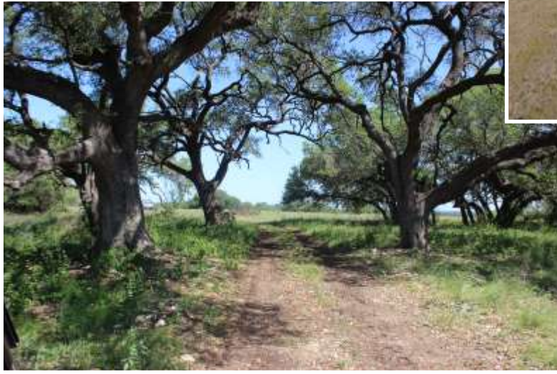
Mature Oak & Native Trees