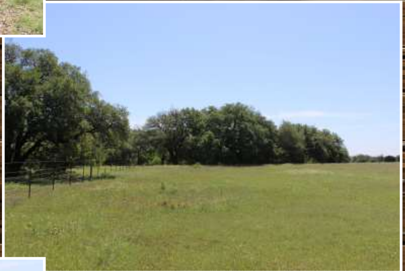
Numerous Building Sites