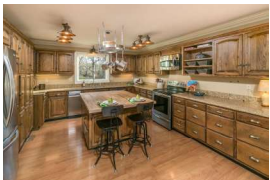
Large Country Kitchen