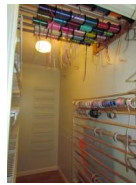
Gift Wrap Closet