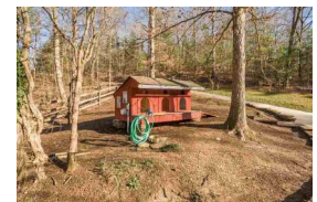
Pet Condo with Power and Water