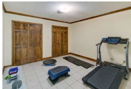
Basement Exercise Room