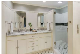
Upstairs Hall Bath