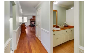
Main level hall