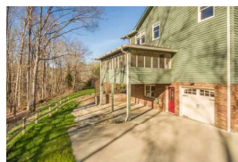
Great Outdoor Entertaining Space