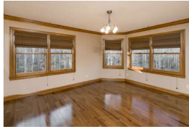
Flex room off of Master