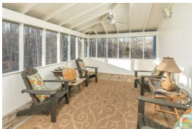
Screened porch off of Kitchen