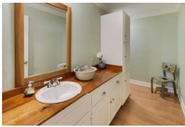
Hall Half Bath