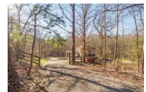
Road to Shed