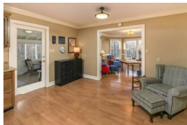
Screened Porch and view into sunroom