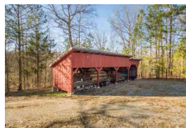
Large Covered Equipment Shed