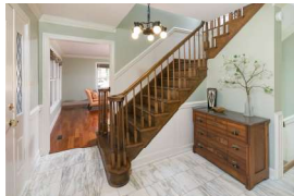
Peak into Living Room from Foyer