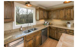
View of Herb Garden from Kitchen Window