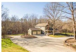
Plenty of Parking