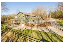
Back of Home