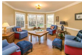
Sunroom off of kitchen