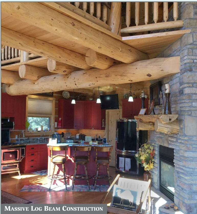
MASSIVE LOG BEAM CONSTRUCTION