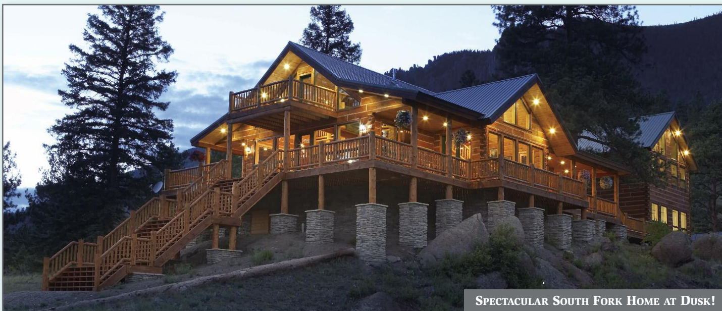
SPECTACULAR SOUTH FORK HOME AT DUSK!

Location: 100 miles from Durango, 48 miles from Alamosa, 235 miles from Denver and 125 miles from Gunnison. Closest commercial airports are in Durango and Alamosa.