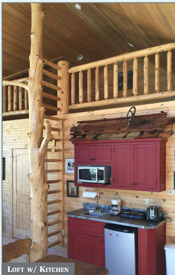
LOFT W/ KITCHEN