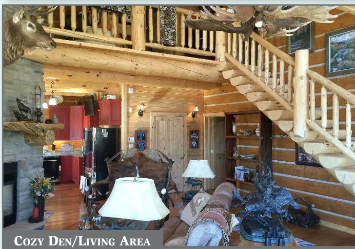
COZY DEN/LIVING AREA