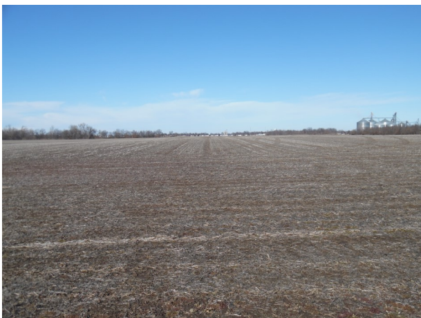
Class A Soils • 138.4 Productivity Index