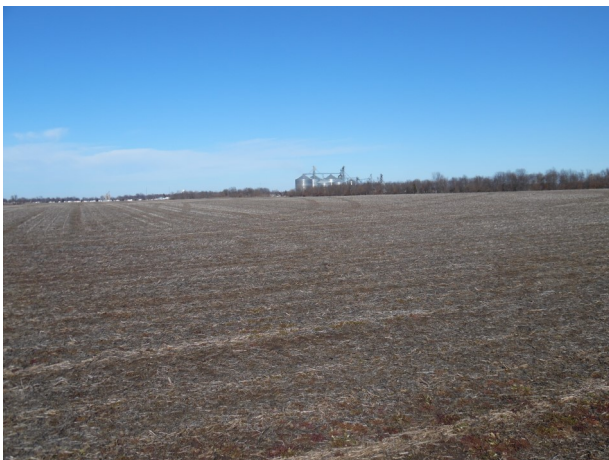
Excellent Access and Location Near Grain Elevator