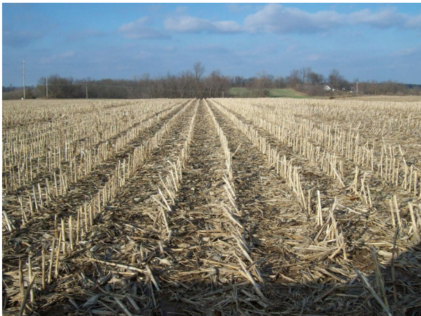
Strong Five Year Yield Averages