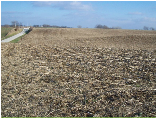
Easy Access Via Blacktop Road