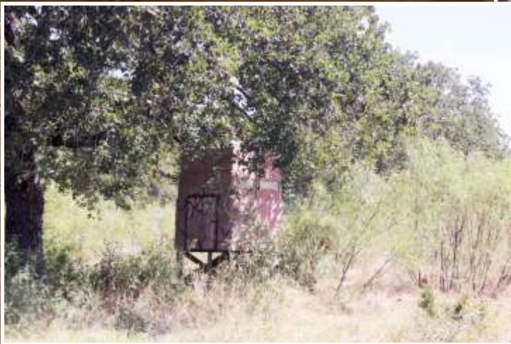
Perfect Hunting Get Away!