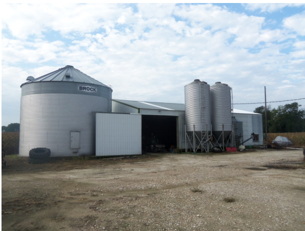
On-site Grain Storage