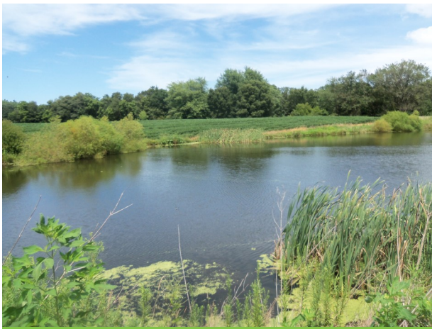
Secluded Recreational Enjoyment