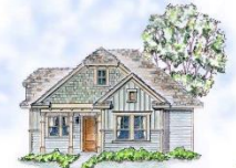
GARDEN COURT COTTAGES