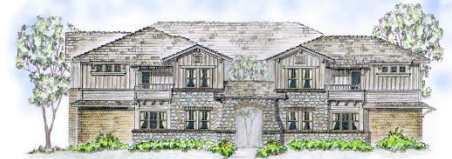
STREET ELEVATION - COURTYARD APARTMENT HOMES

LARRY W. GARNETT, FAID DESIGN & PLANNING 254.897.3918