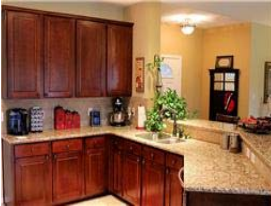
Custom cabinetry, granite & recessed lighting