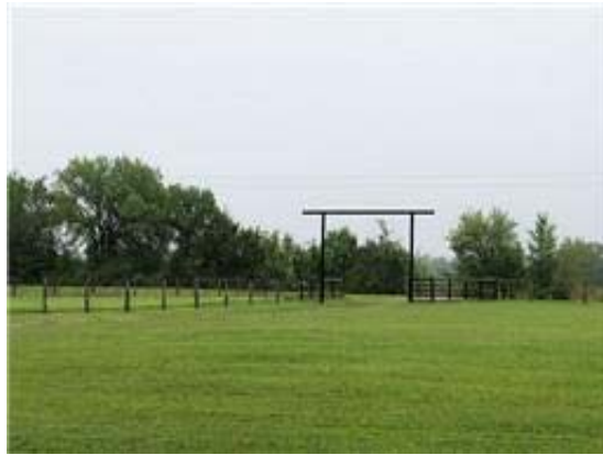
A grand entrance for a grand home!