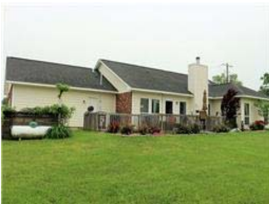
Custom deck - a great place to enjoy the beautiful views!