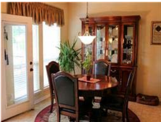
Eat in kitchen