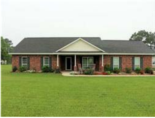
Custom Home built 2010