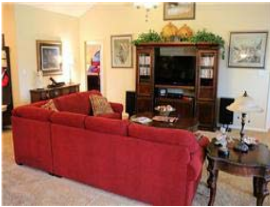
Living room is 16X22, lots of space to stretch out