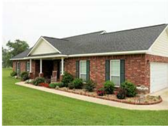
Notice the long concrete walkway