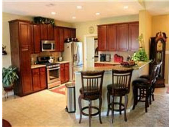
Open concept makes entertaining easy