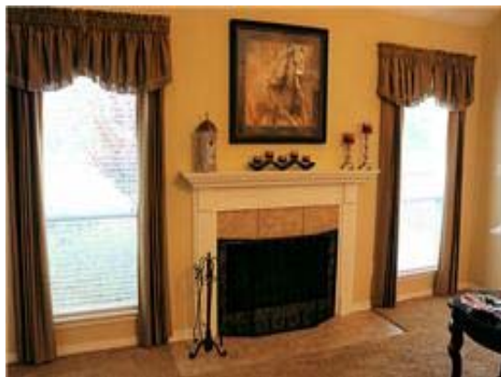
A beautiful room that showcases the fireplace