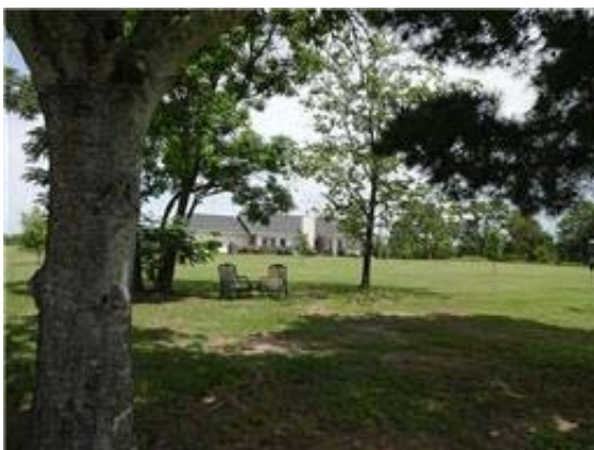
3.52 AC is immaculately maintained - park like setting