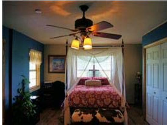
Second Master Suite