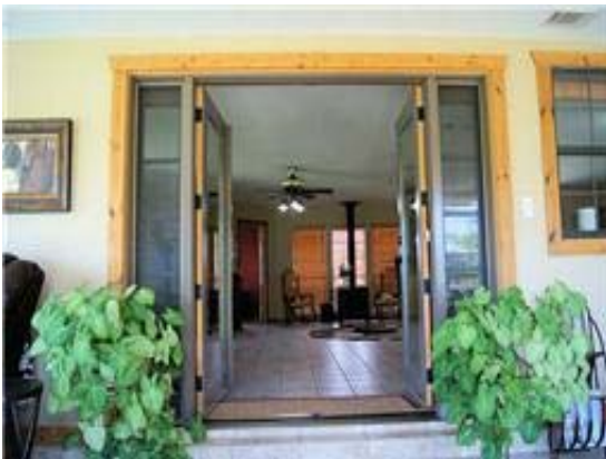
Leading to all-season room