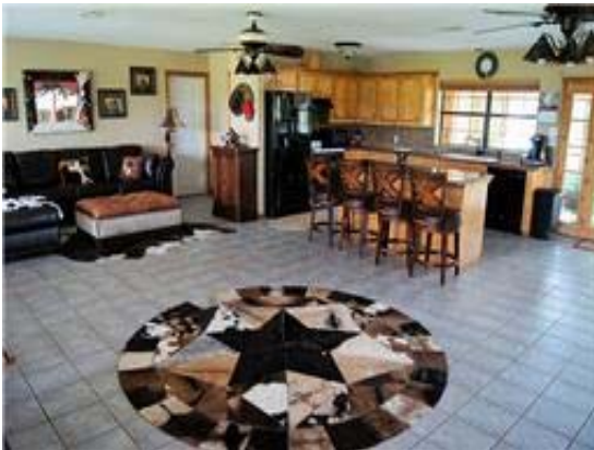
Open concept living/dining