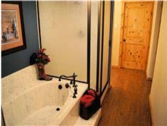
Master bath featuring soaking tub & separate shower