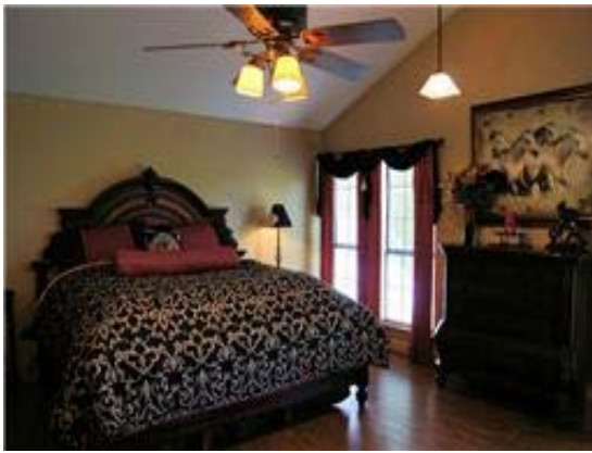
Master Suite with elegant cathedral ceiling