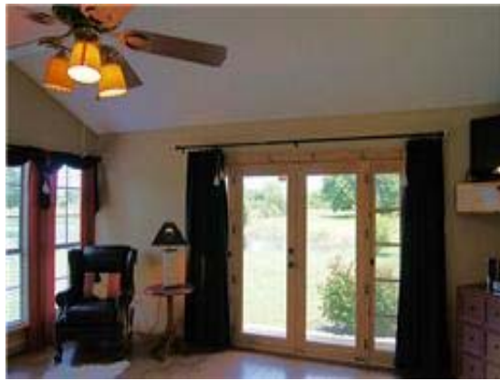
Second view of the 1st Master Suite - panoramic views of the lake & acreage