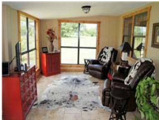
Enjoy the views of your acreage & lake