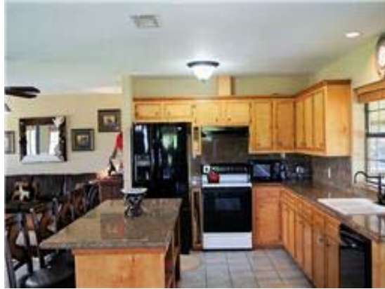
Tile flooring, granite counters, lots of storage space & cabinetry