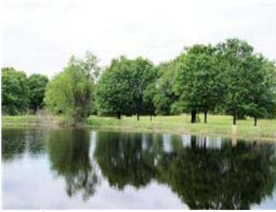
2.5 AC Lake wraps around the back of the home