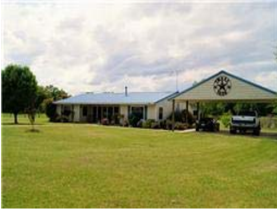
Front view of home 3396 SF, main addition added 2010