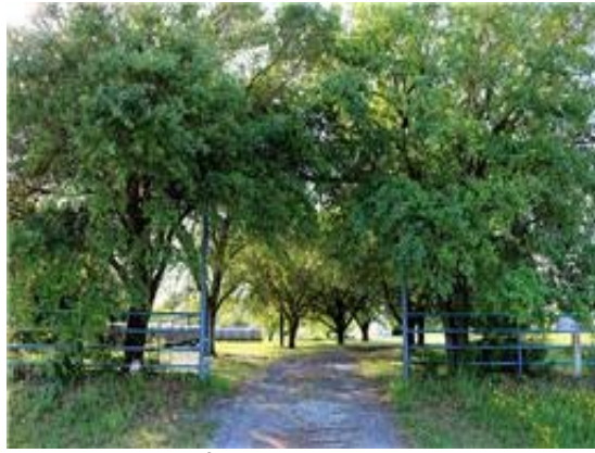
Beautiful Pipe Fence Entrance