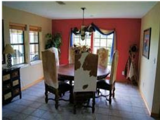
Formal dining room