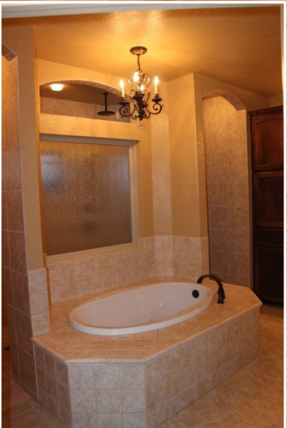
Large Master Bath

Directions: East on Main to Hwy. 84 & 36 junction. Follow the road to the right and take Hwy. 36 approx. 1 mile to F.M. 107, turn left onto 107 and drive approx. 6.2 miles.