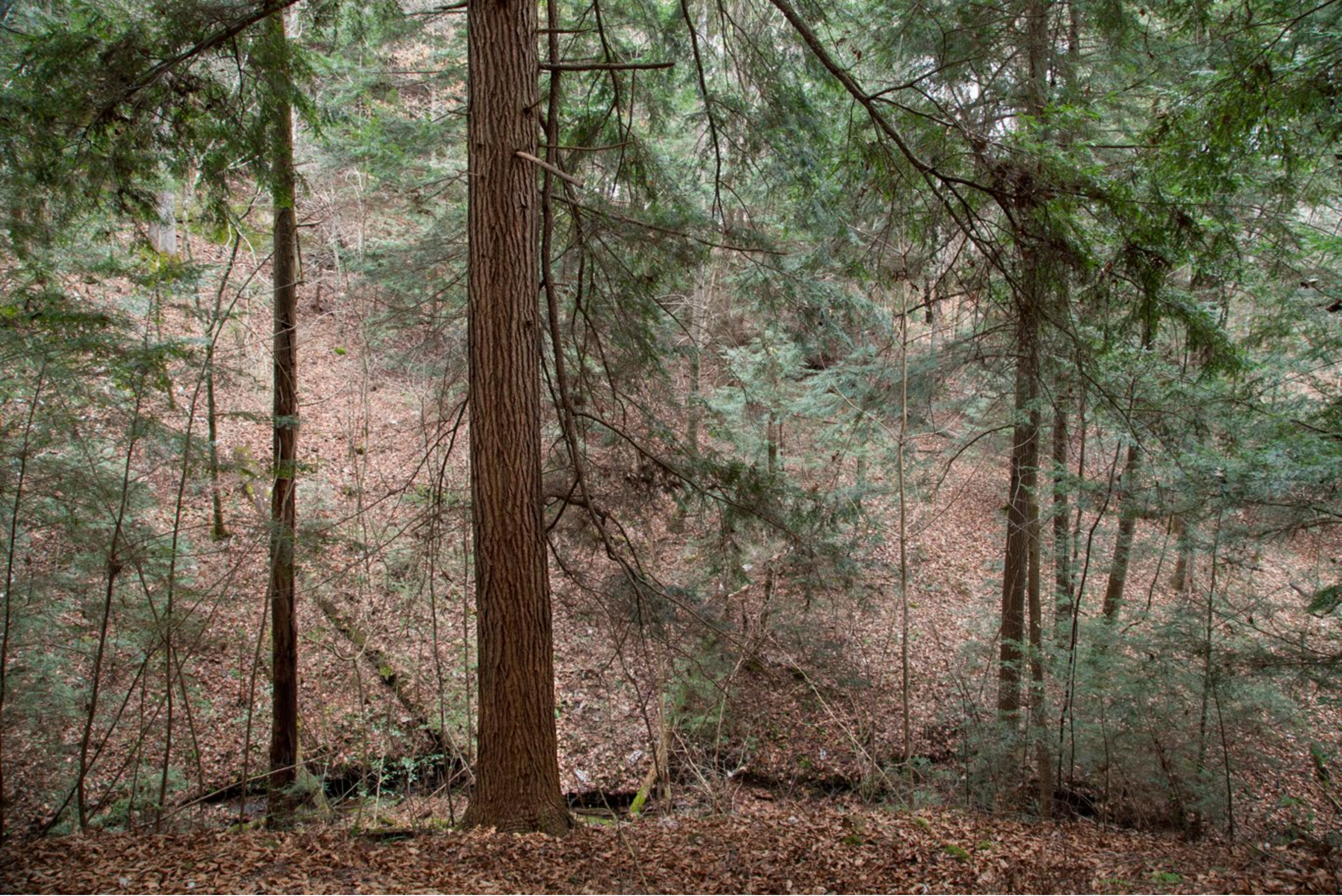
Hemlock trees on the west side of the creek.