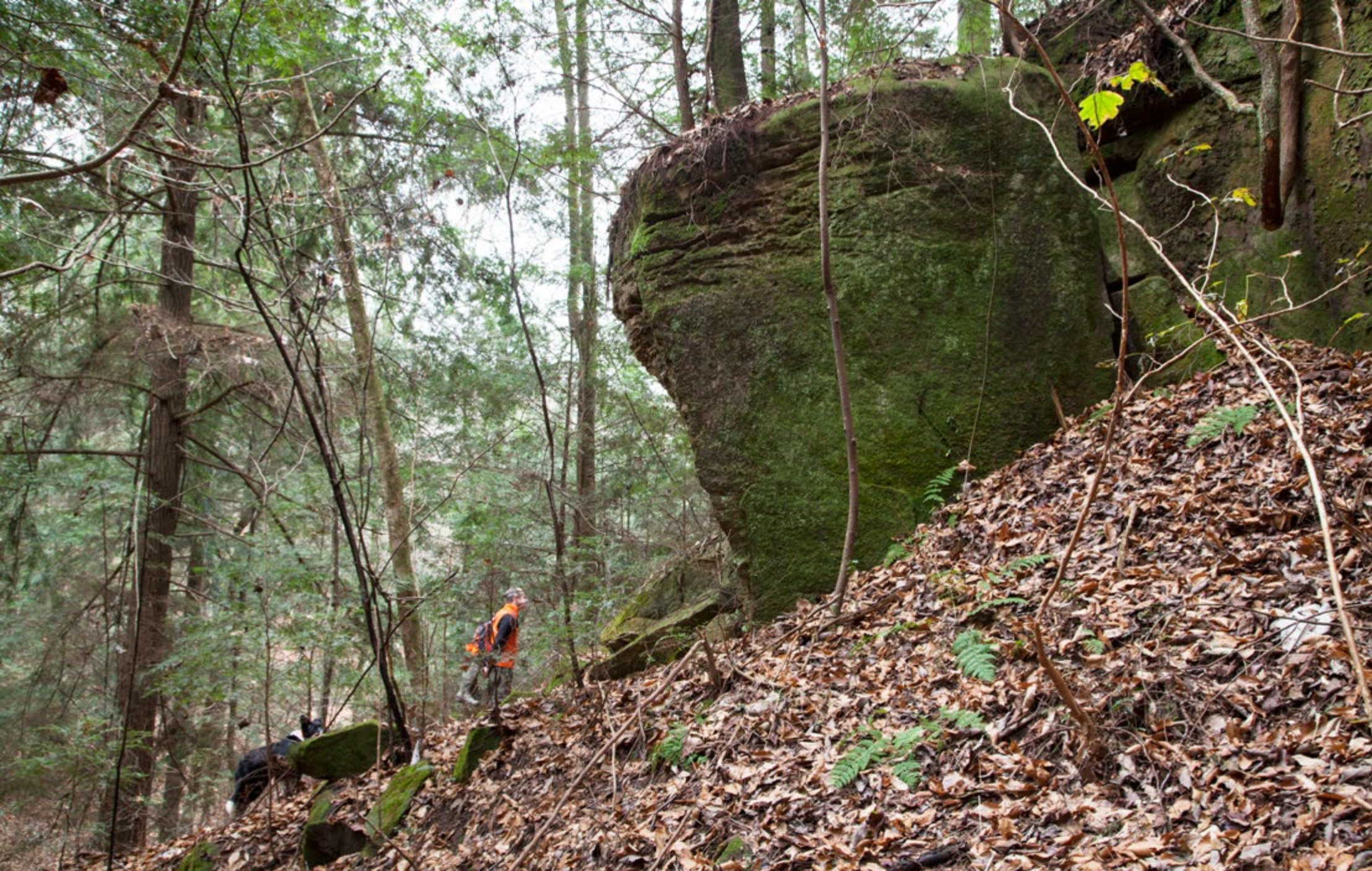
Bluffs on the west side of the creek.