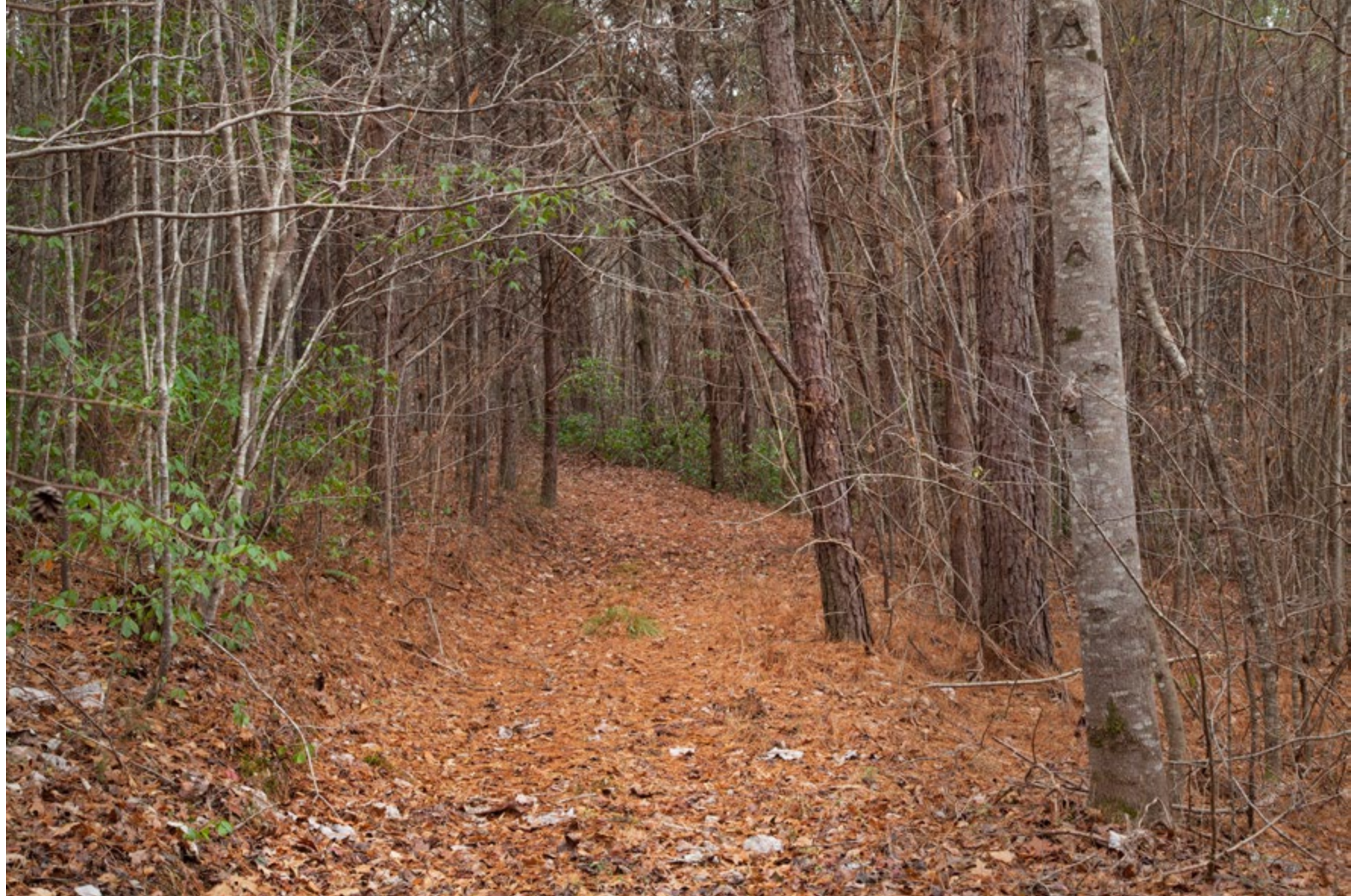
Four wheeler trails throughout the east side of the property and a level site (right) for a cabin in the woods. Very Private.