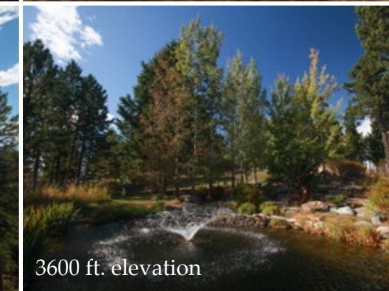
3600 ft. elevation