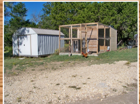
Energy Efficient Upgrades