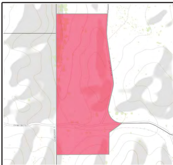
Parcel highlighted in red

General Plan Designation: MULTIPLE DESIGNATIONS