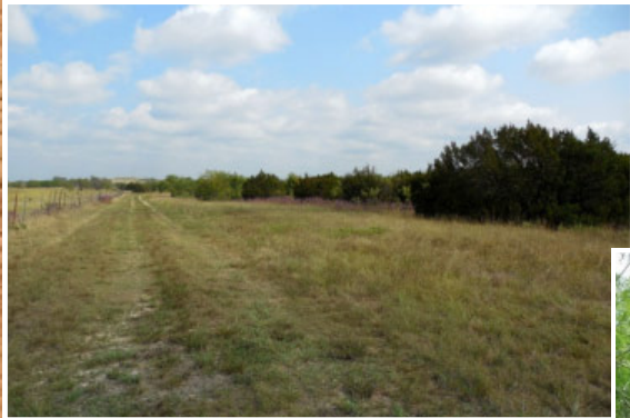
Hunting Trailer on Back of Property