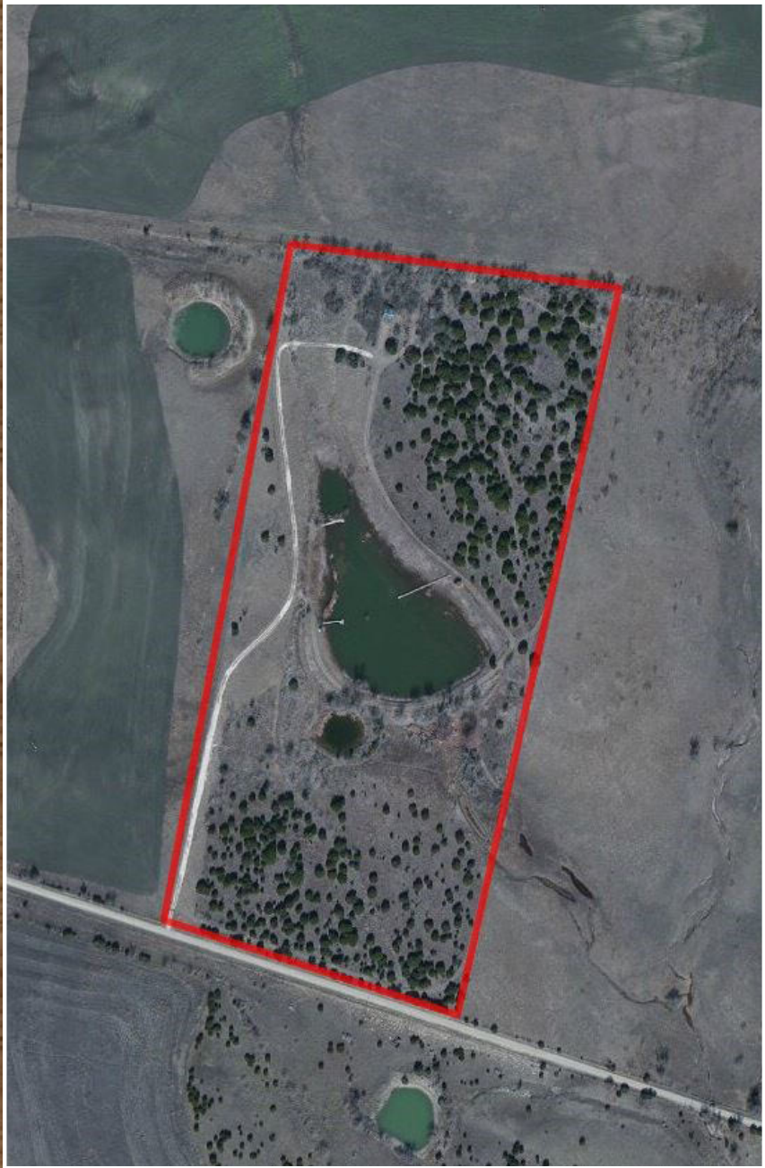
Boundary Lines Are An Approximation And Are Not Exact