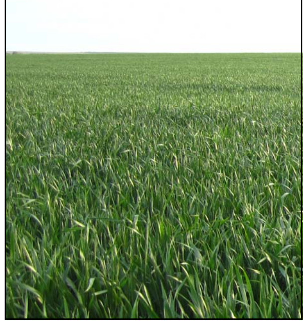
These Three Quarters of Cheyenne County Cropland are located in an excellent wheat producing area, approximately 3 miles west of Bird City, Kansas.