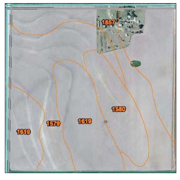
Tract 1 - 160± Acres

NW/4 Sec. 5, 4-38 Cheyenne Co., KS 156.47± Acres Cropland