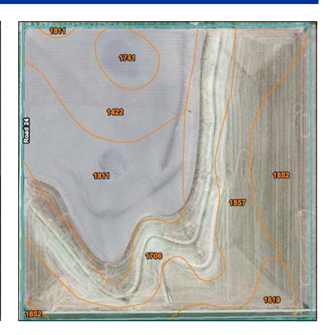
Tract 3 - 160± Acres

SW/4 Sec. 8, 4-38 Cheyenne Co., KS 158.16± Acres Cropland