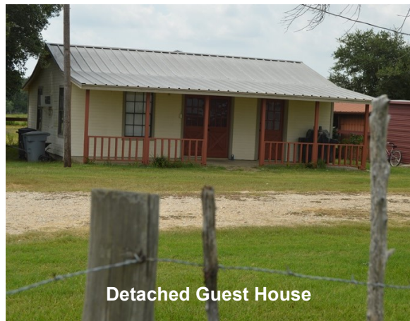
Detached Guest House