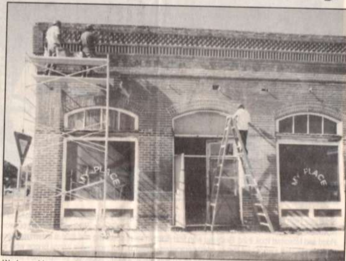
Workers chip away at the old facade of My Place, a long-time landmark in downtown Sealy. Milton and DeeDee Beckendorf, who own the building, are restoring it and will open Country Antiques there.

One step further into the history of the building was the floor plate on the front entrance on Fowlkes Street. No name is on the plate, but the outer ends have two raised stars.