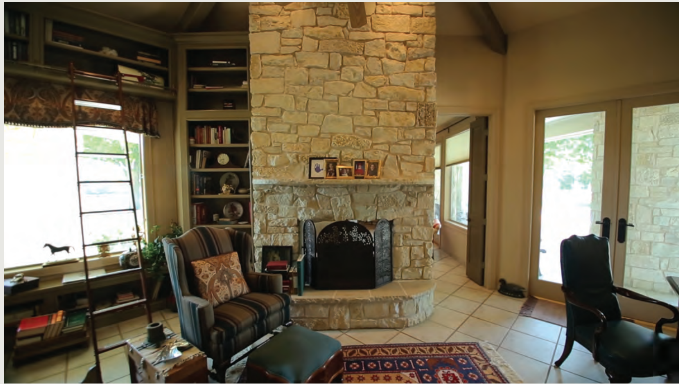
Cozy sitting room/library