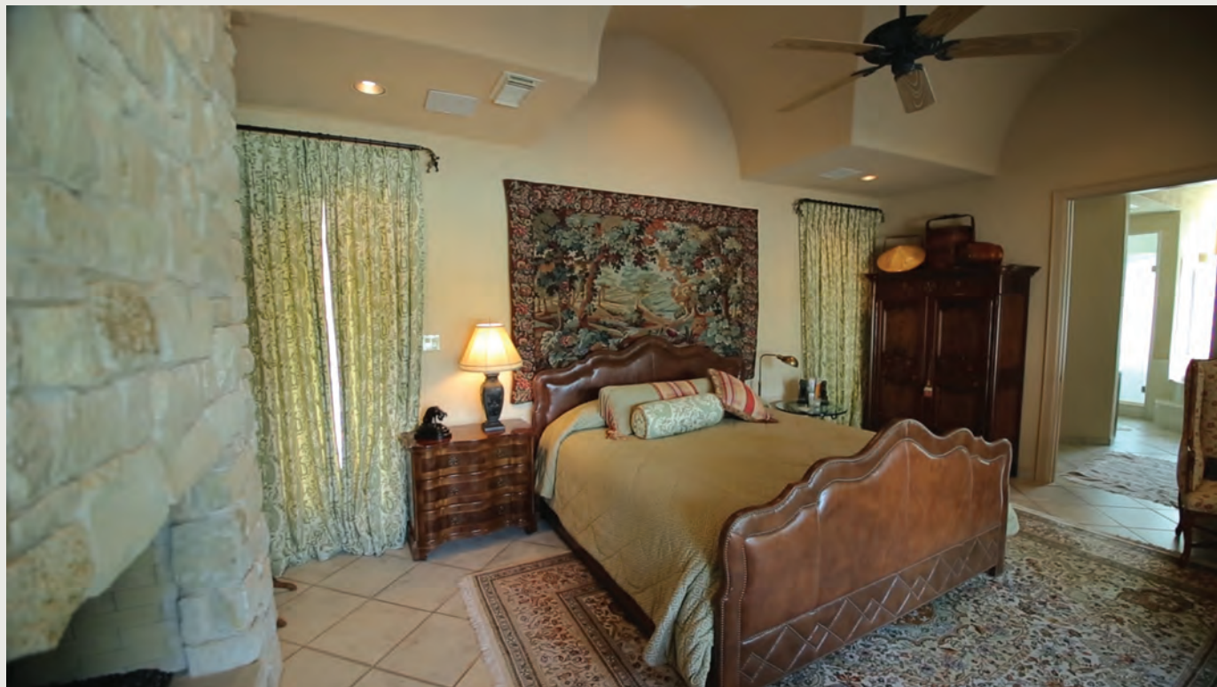
Master suite has fireplace and French doors to pool area