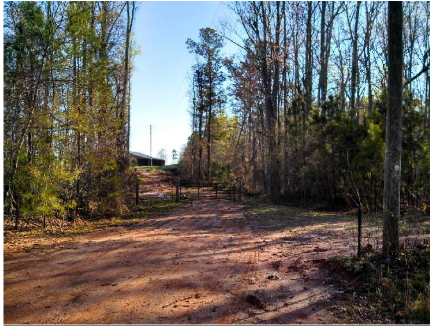
Entry from Ellis road