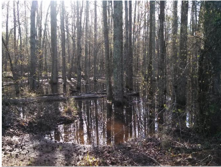
Duck Swamp Area