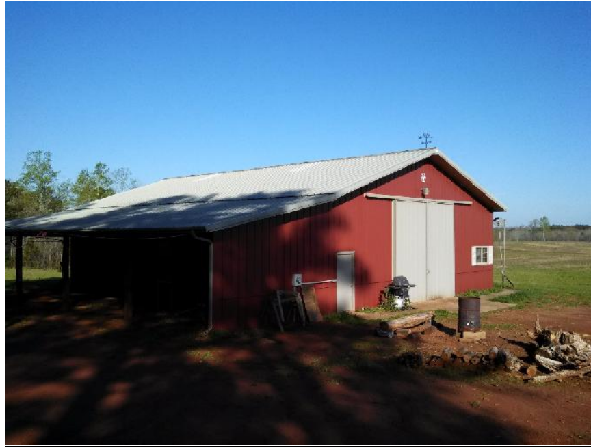
Barn with Apartment