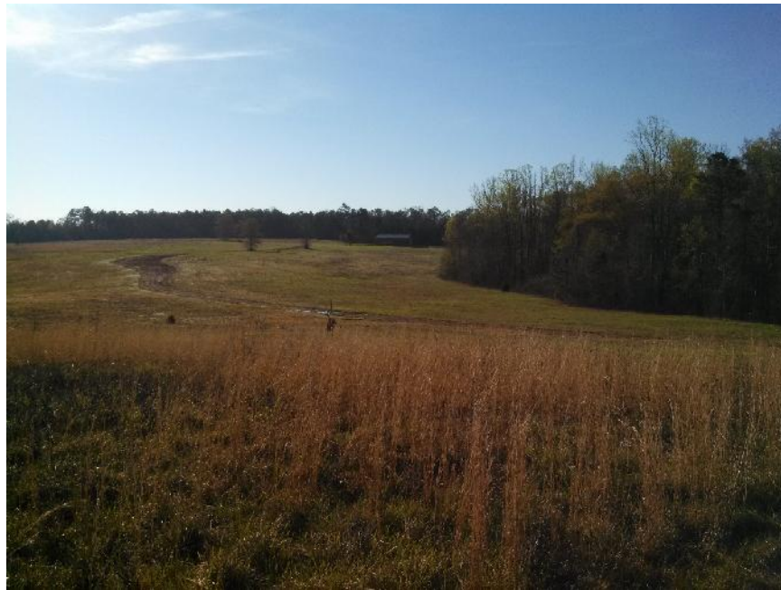
Open Land and Interior Road