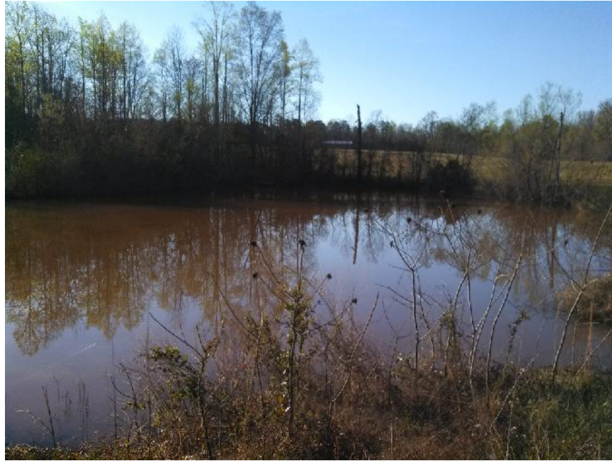
View of Pond