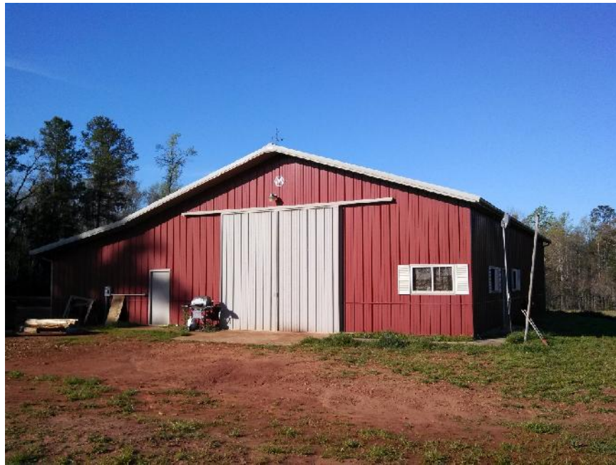
Barn with apartment