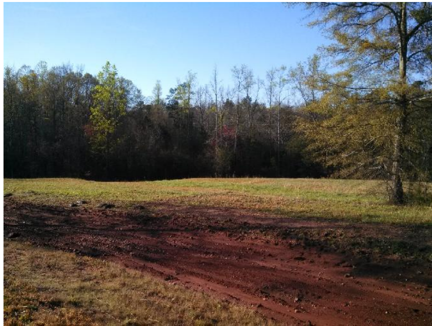
Open Land and Interior Road