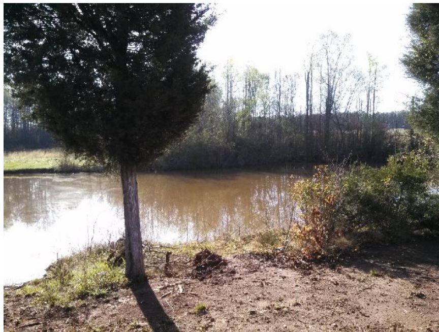
View of Pond