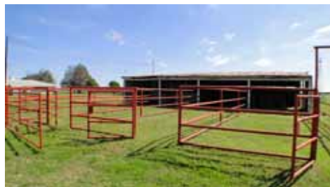
Horse barn w. 8 stalls & 4 runs

Asphalt Co-op Water Co-op Electric Septic Well Rural Water District Outside City Limits