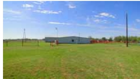
Horse barn w. 8 stalls & 4 runs