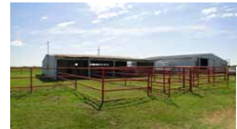
Horse barn w. 8 stalls & 4 runs