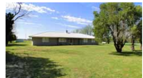
Front of Home from Distance