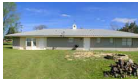
Back of Home