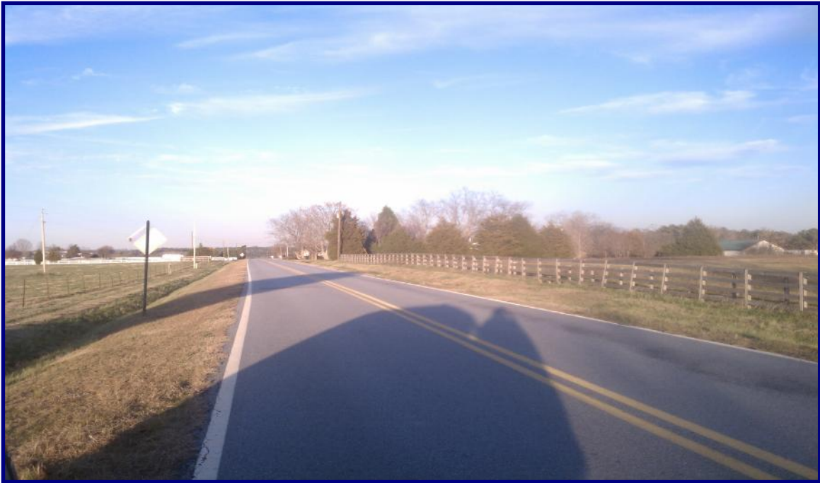
Fencing on Property Road Frontage