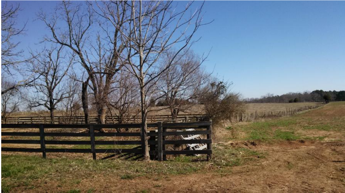
Property from Sandy Creek looking NE

This information has been obtained from sources believed reliable. We have not verified it and make no guarantee, warranty or representation about it. Any projections, opinions, assumptions or estimates used are for example only and do not represent the current or future performance of the property. You and your advisors should conduct a careful, independent investigation of the property to determine to your satisfaction the suitability of the property for your needs. THIS PROPERTY IS BEING SOLD AS IS, WHERE IS, WITH ALL FAULTS. Seller makes no warranties, no representations and is not responsible for any information supplied within this marketing package presented by broker.