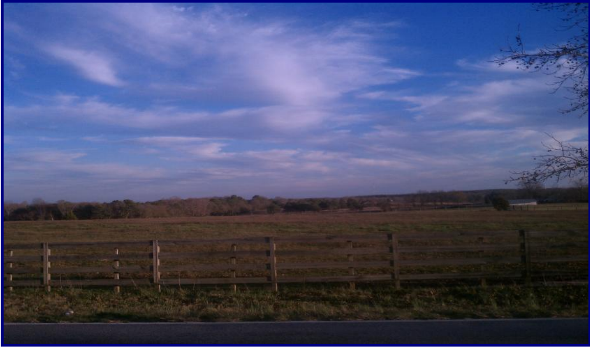
Facing Property from Fairplay Road