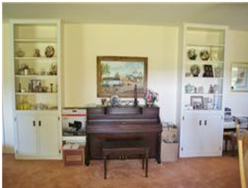
Living room with built in's