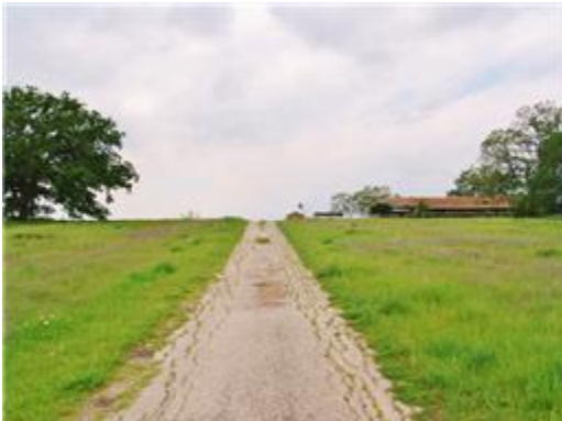
Driveway entrance leading directly to home on hill