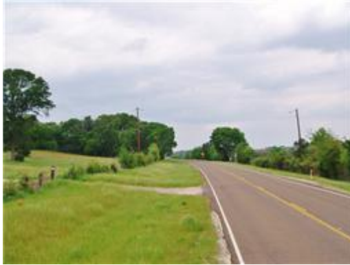
1452 E looking towards Hwy 21