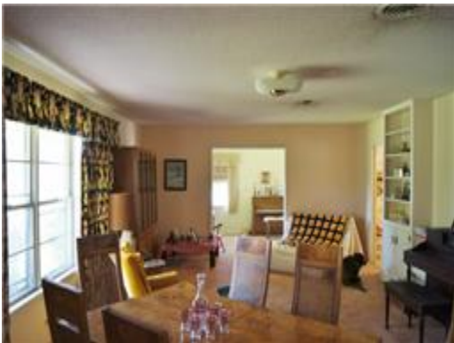
View of the LR