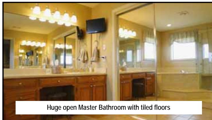
Huge open Master Bathroom with tiled floors