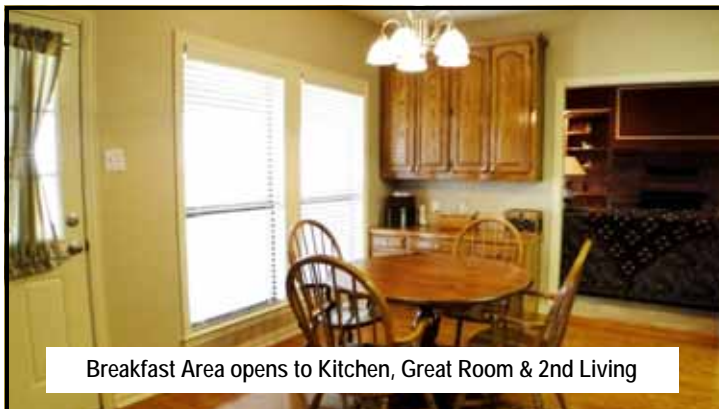
Breakfast Area opens to Kitchen, Great Room & 2nd Living