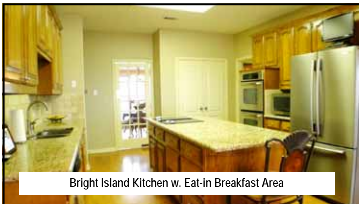
Bright Island Kitchen w. Eat-in Breakfast Area