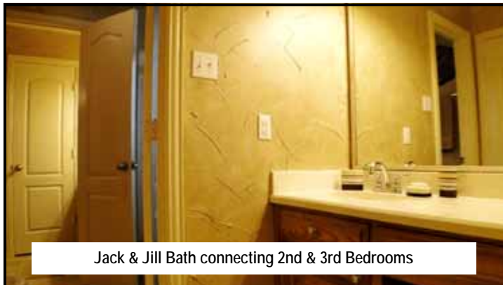
Jack & Jill Bath connecting 2nd & 3rd Bedrooms