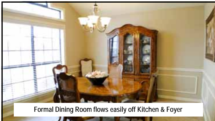
Formal Dining Room flows easily off Kitchen & Foyer