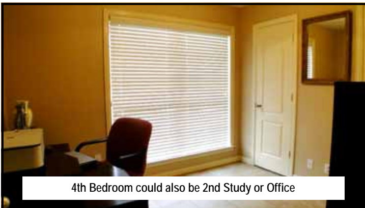
4th Bedroom could also be 2nd Study or Office