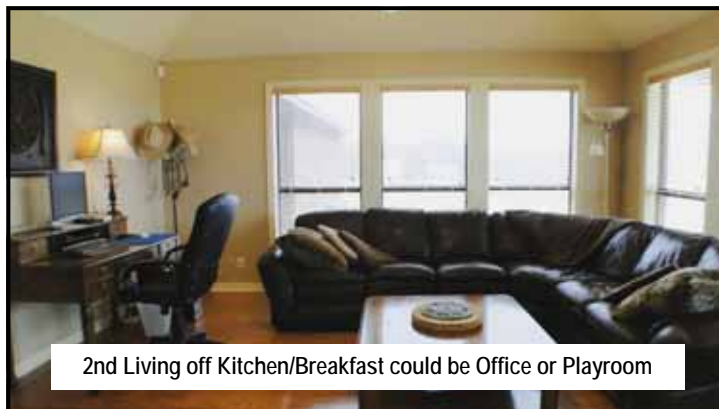
2nd Living off Kitchen/Breakfast could be Office or Playroom