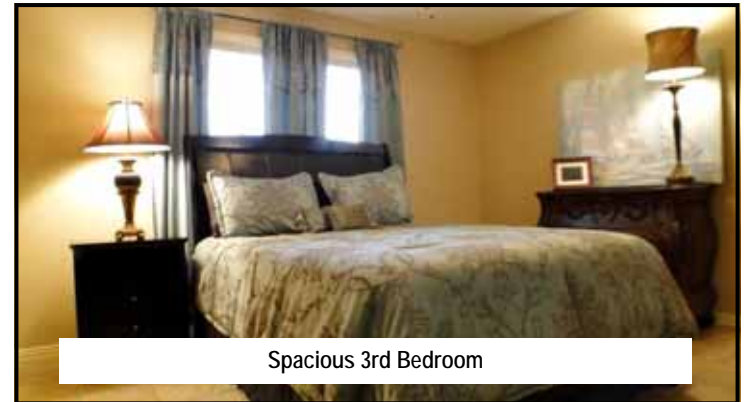
Spacious 3rd Bedroom