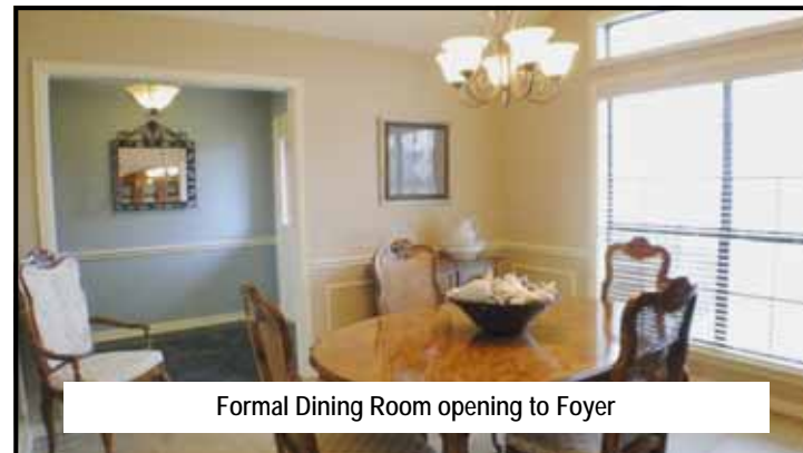
Formal Dining Room opening to Foyer