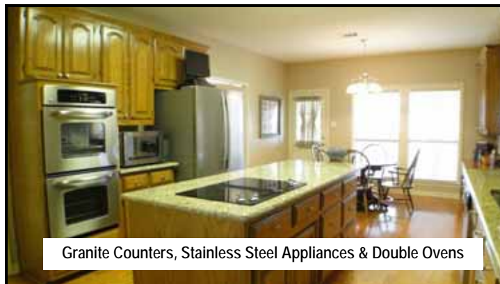
Granite Counters, Stainless Steel Appliances & Double Ovens