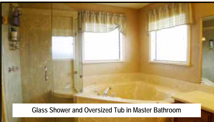
Glass Shower and Oversized Tub in Master Bathroom