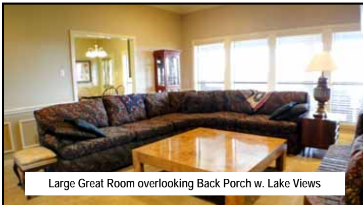
Large Great Room overlooking Back Porch w. Lake Views