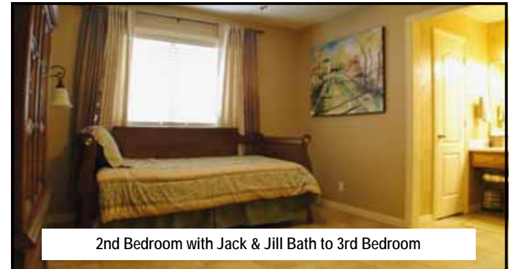
2nd Bedroom with Jack & Jill Bath to 3rd Bedroom