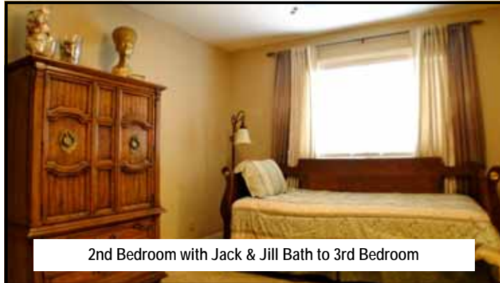
2nd Bedroom with Jack & Jill Bath to 3rd Bedroom