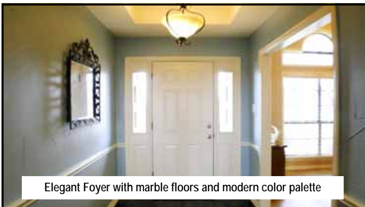
Elegant Foyer with marble floors and modern color palette