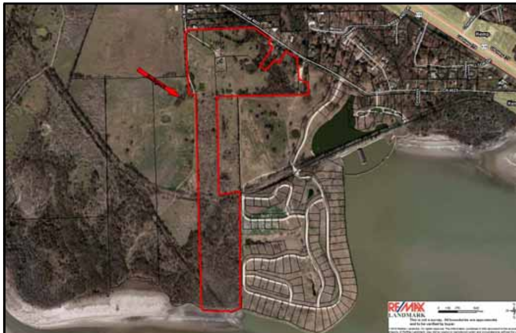
Fantastic wildlife—duck hunter's paradise!