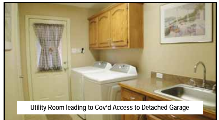
Utility Room leading to Cov'd Access to Detached Garage