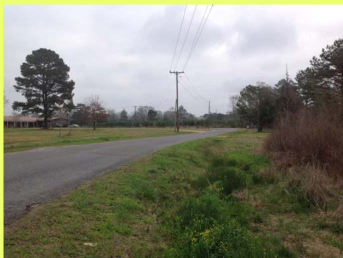
View East along Daniel Road.

Office 601.587.4446 • Cell 601.594.1564 • Fax 601.587.4406