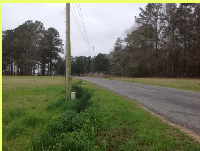
View West along Daniel Road