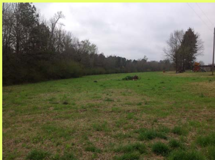
View South of Tract.