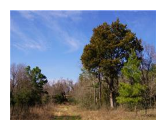
Data Not Verified/Guaranteed by MLS Obtain signed HAR Broker Notice to Buyer Form