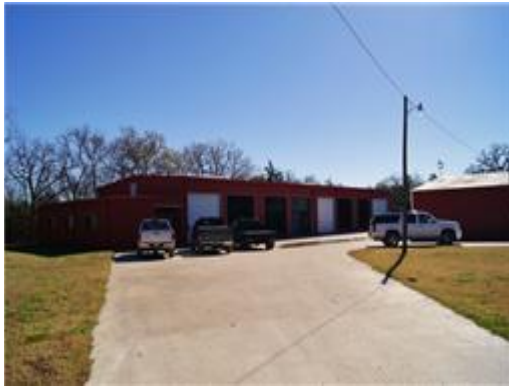
Main Barn - Office, Recreation area, bathroom & HD Equip Storage