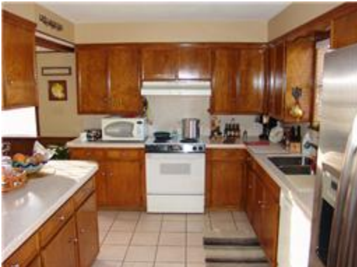
New counter tops, custom cabinets, tile flooring