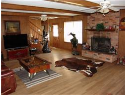
Living room w/ wood-burning FP