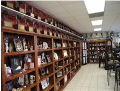
Main Barn - Built In's