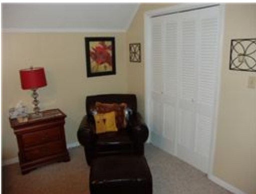
Spare Bedroom - 2nd view