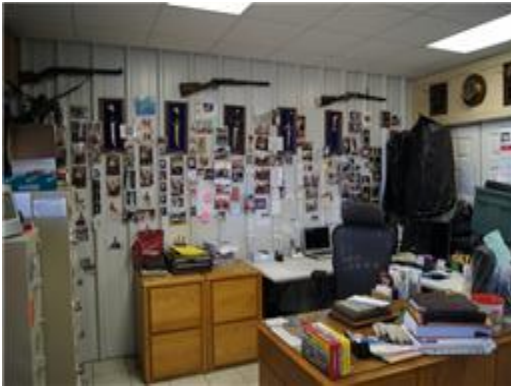
Main Barn - Office