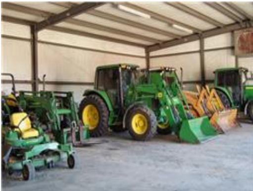
Main Barn - Sep. from office