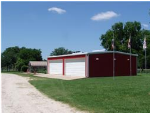
Garage and custom greenhouse