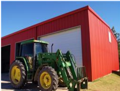
Main Barn - Exterior