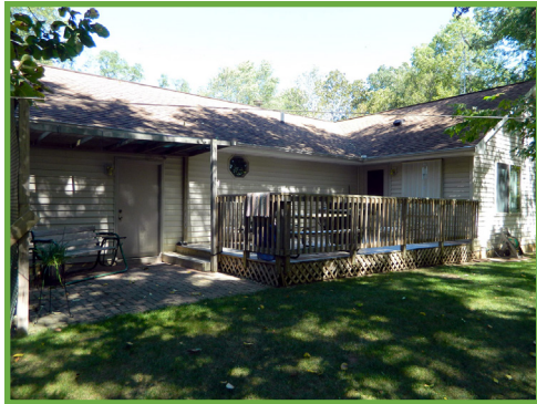
Lovely Back Porch