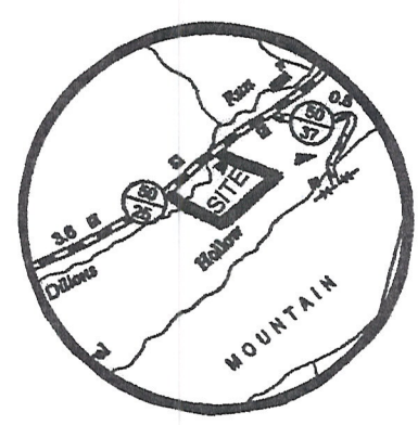
VICINITY MAP SCALE: 1" = 1 MILE

NOTE A: THIS SURVEY MAKES NO ATTEMPT TO LOCATE ANY RIGHTS-OF-WAY, EASEMENTS, ROADBEDS, DRAINS OR STRUCTURES EXCEPT THOSE SHOWN ON THIS PLAT.