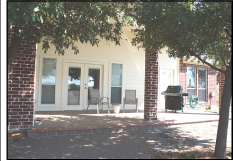
Huge Covered Patio