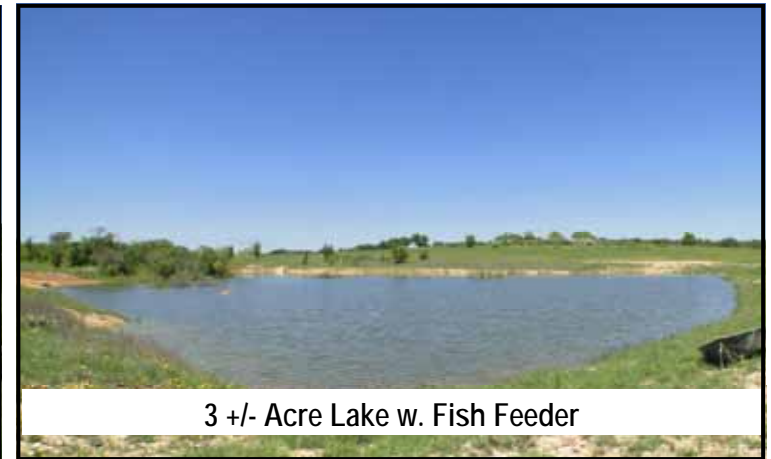
3 +/- Acre Lake w. Fish Feeder