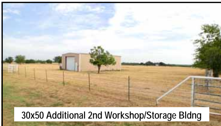
30x50 Additional 2nd Workshop/Storage Bldng