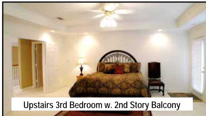
Upstairs 3rd Bedroom w. 2nd Story Balcony