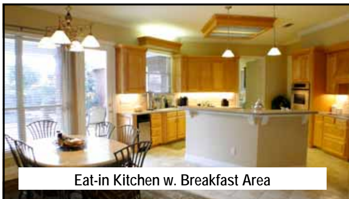
Eat-in Kitchen w. Breakfast Area