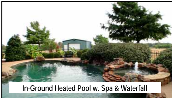
In-Ground Heated Pool w. Spa & Waterfall