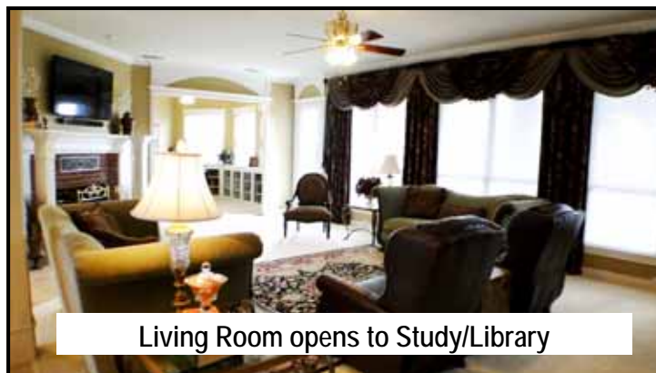
Living Room opens to Study/Library