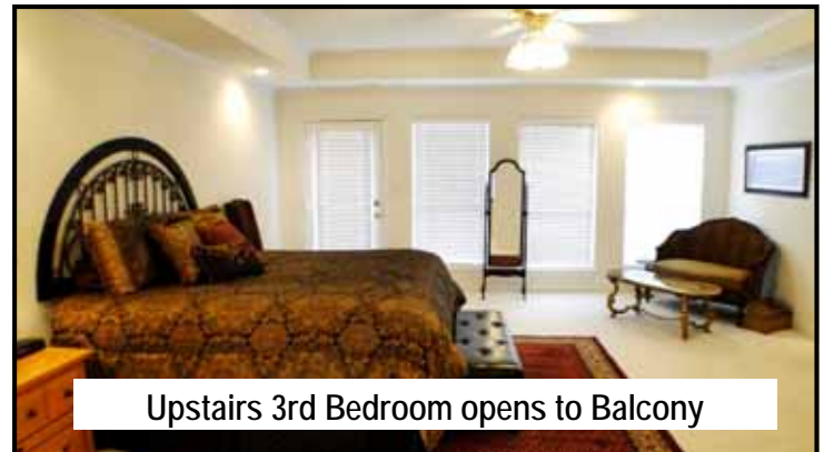
Upstairs 3rd Bedroom opens to Balcony