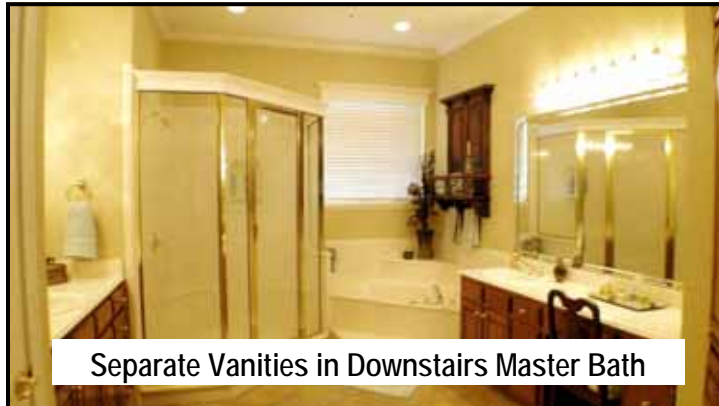
Separate Vanities in Downstairs Master Bath

DOWNSTAIRS MASTER SUITE AND UPSTAIRS BEDROOMS: