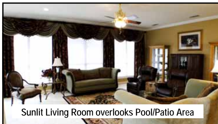
Sunlit Living Room overlooks Pool/Patio Area