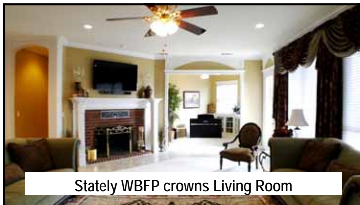
Stately WBFP crowns Living Room