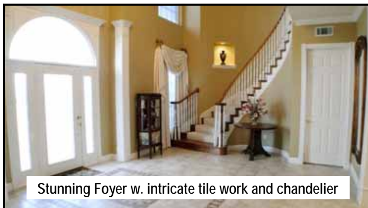
Stunning Foyer w. intricate tile work and chandelier