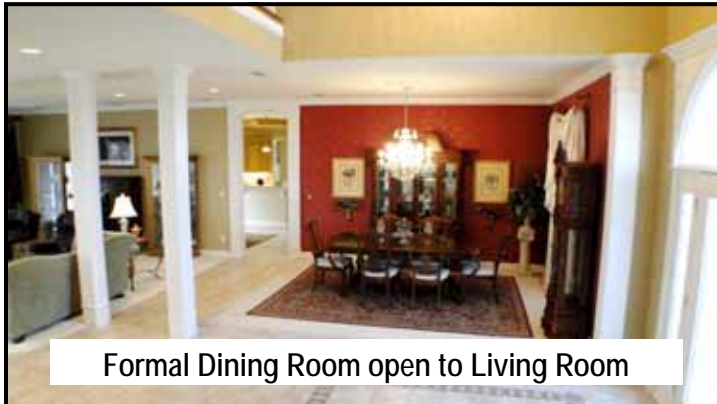
Formal Dining Room open to Living Room