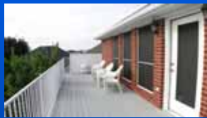
Balcony off 3rd Bedroom