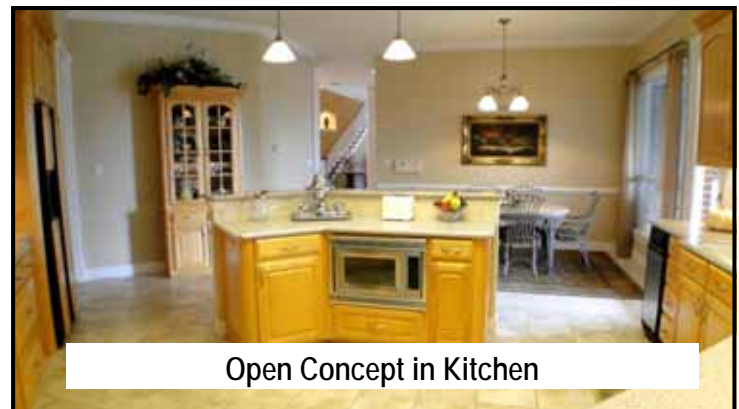
Open Concept in Kitchen