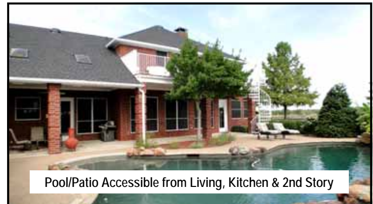
Pool/Patio Accessible from Living, Kitchen & 2nd Story