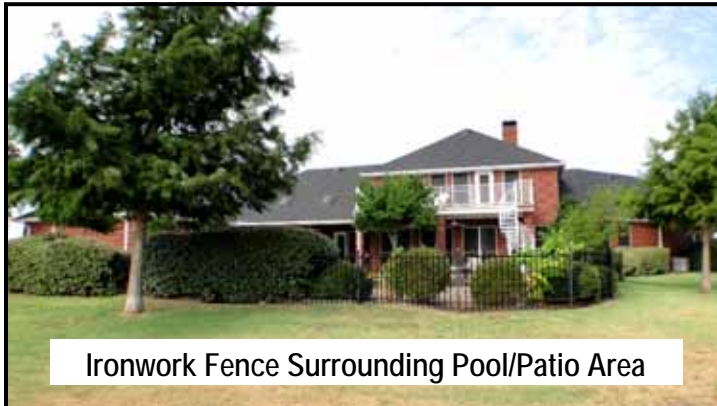
Ironwork Fence Surrounding Pool/Patio Area