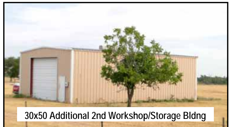
30x50 Additional 2nd Workshop/Storage Bldng