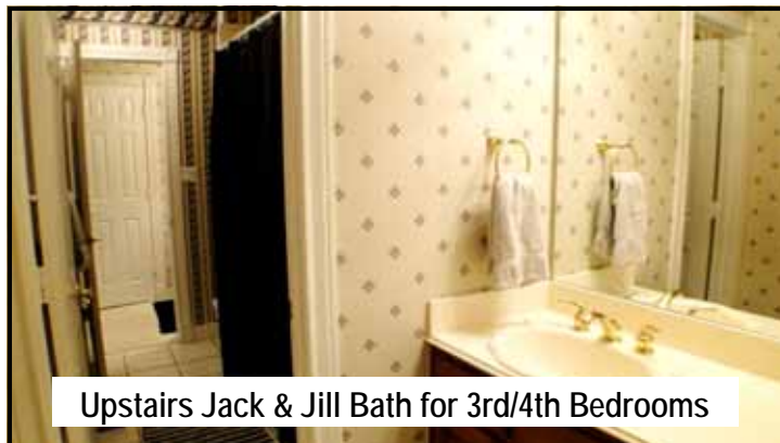
Upstairs Jack & Jill Bath for 3rd/4th Bedrooms