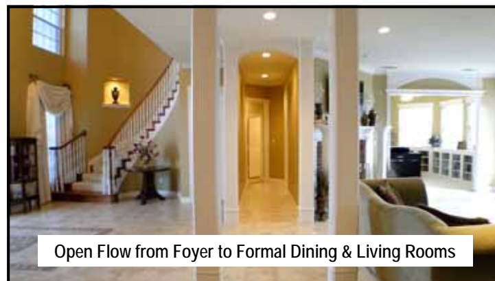
Open Flow from Foyer to Formal Dining & Living Rooms