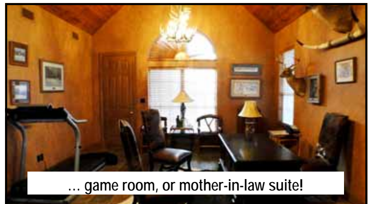
... game room, or mother-in-law suite!