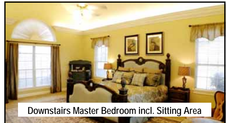
Downstairs Master Bedroom incl. Sitting Area