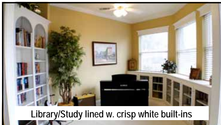
Library/Study lined w. crisp white built-ins