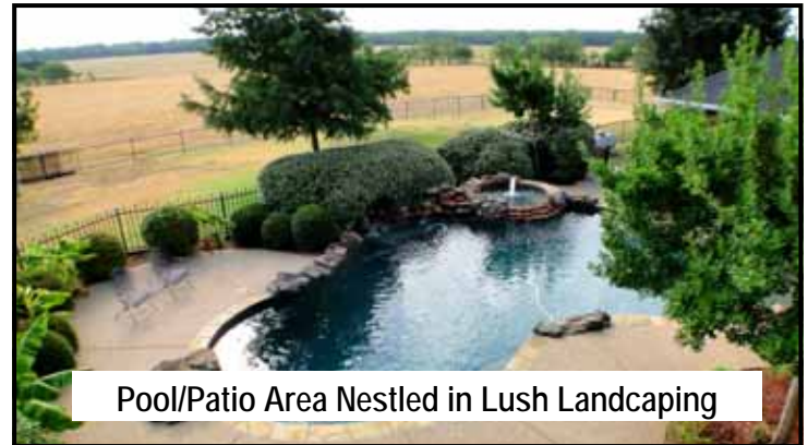
Pool/Patio Area Nestled in Lush Landscaping