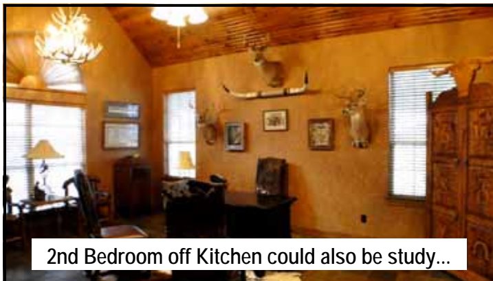
2nd Bedroom off Kitchen could also be study...