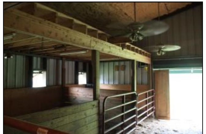
4 Stall Barn

Information contained herein has been obtained from the owner of the property or obtained from other sources that we deem reliable. We have no reason to doubt its accuracy, but we do not guarantee it.