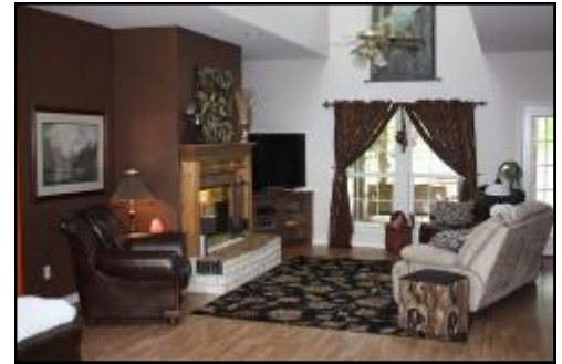
Well maintained home! Open and bright with hard wood floors in 18X18 living area.