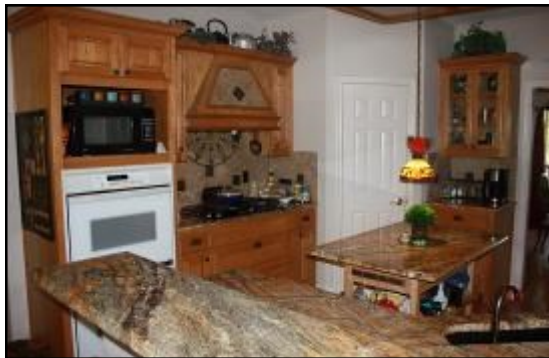
The chef of the family will love this AMAZING kitchen.