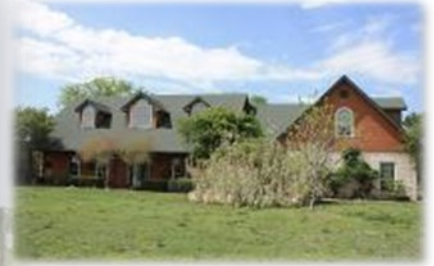
Custom Built Home