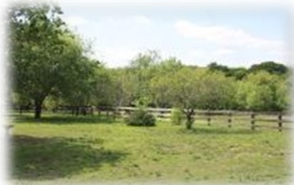
Gorgeous Private Setting