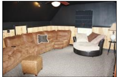
Upstairs 20X15 Media Room