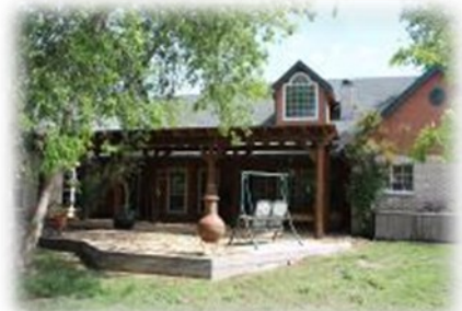
Private Shaded Sitting Area

Cream of the crop luxury 4/3.5/3, 4190 SF home loaded with the most incredible party barn complete with 800 SF living quarters perfect for that older child or mom.