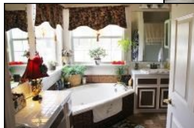
Spacious Master Bedroom with Sitting Area