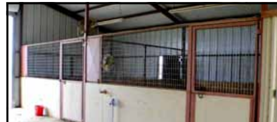
Stalls in Barn Next to Home