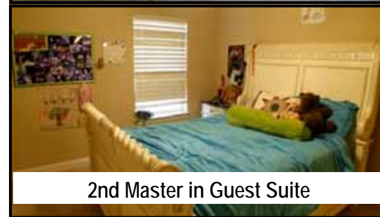
2nd Master in Guest Suite