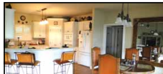
Eat-in Kitchen Bar & Breakfast Area