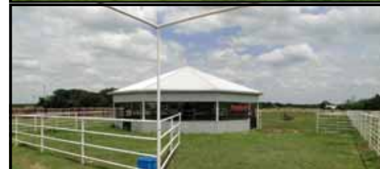
Covered Electric Walker