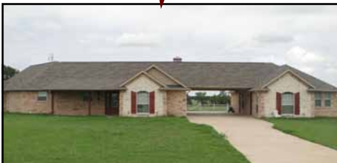
Ranch Style Home w. Separate Entry