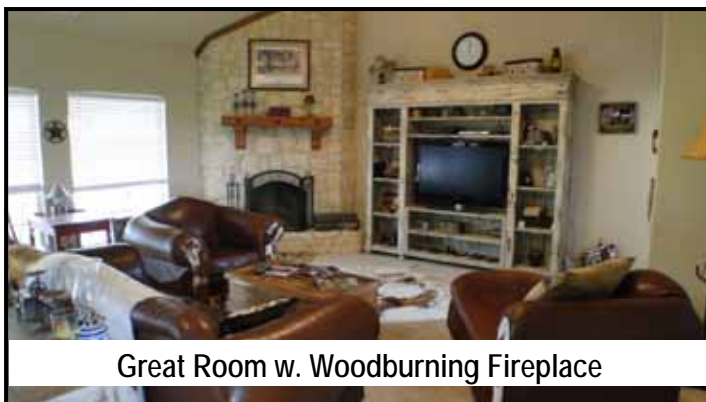
Great Room w. Woodburning Fireplace