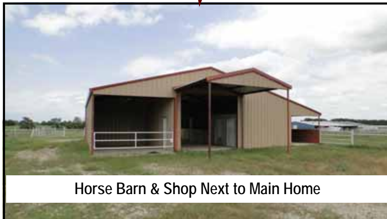
Horse Barn & Shop Next to Main Home

Ranch features enclosed arena, 15-stall barn + 6 stalls-runs, large hay barn-workshop, pipe fencing, incredible cattle & horse handling facilities. Excellent Brick & Stone 2 bed, 2 bath Ranch Home with open concept boasts large master, large living crowned by stone fireplace, bright kitchen & tile throughout. Separate entry for 2nd bedroom suite w living room and kitchenette. 2nd Home as Well.