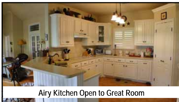
Airy Kitchen Open to Great Room